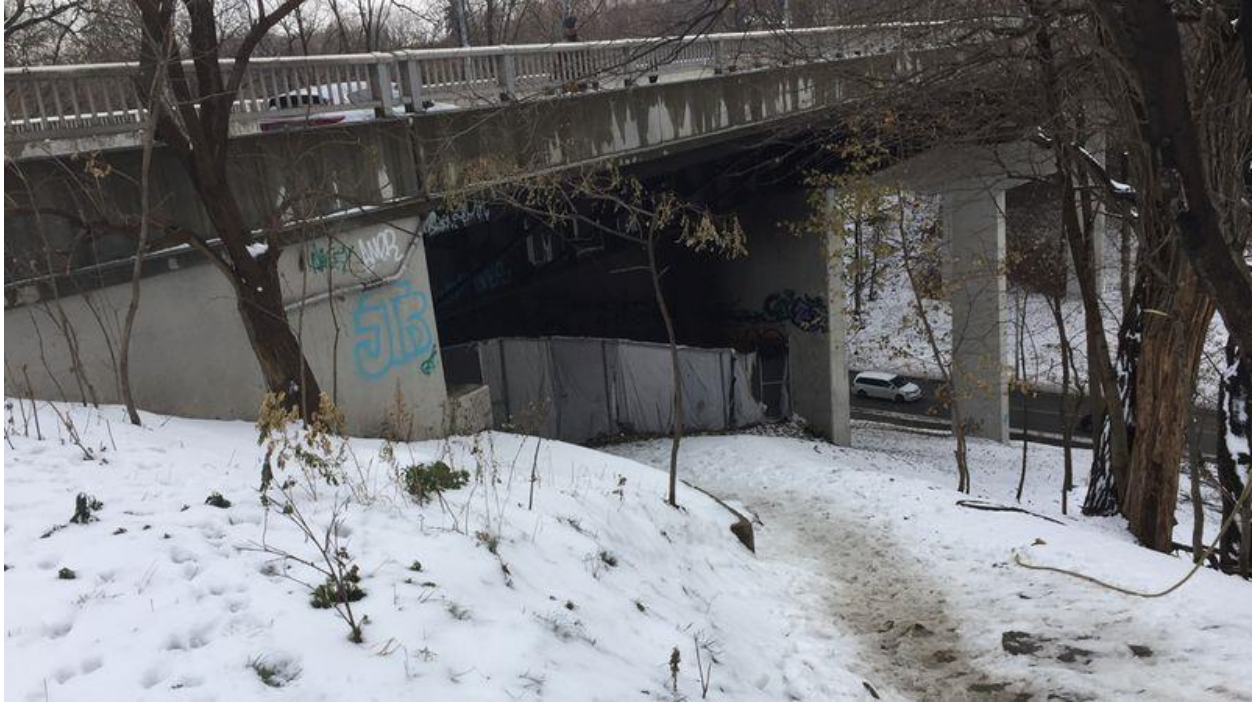
Prior to the Fire taken at the beginning of Dec for follow up to the City.