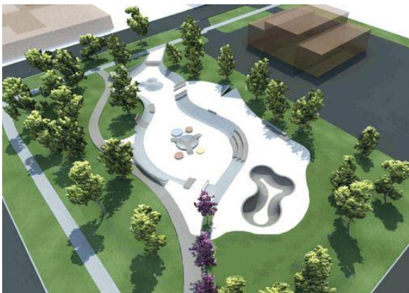
Eighth St Skatepark Etobicoke 930 sq. m