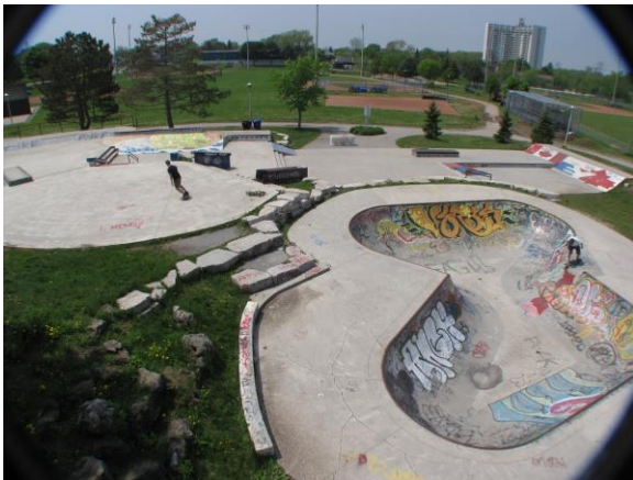
Stan Wadlow Skatepark East York 930 sq. m

Two very popular existing community skateparks in Toronto are large enough to offer a diversity of terrain that caters to beginner, intermediate and advanced riders. The current budget allocated to community skateparks is not sufficient to build the types of facilities