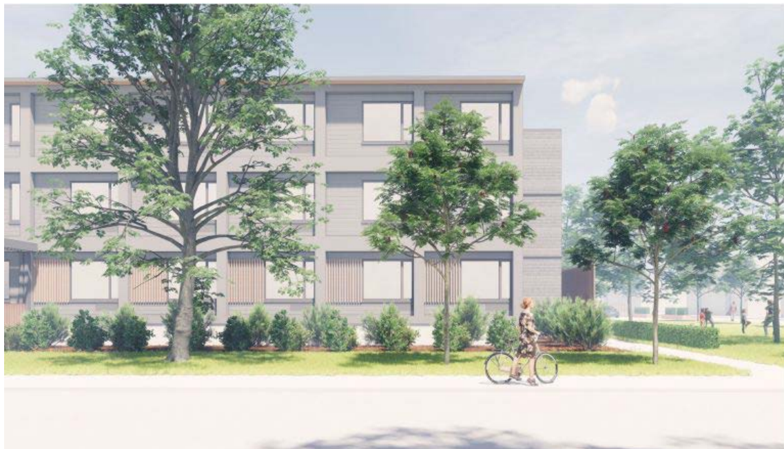
Preliminary artist's rendering, subject to final approval – Dovercourt frontage