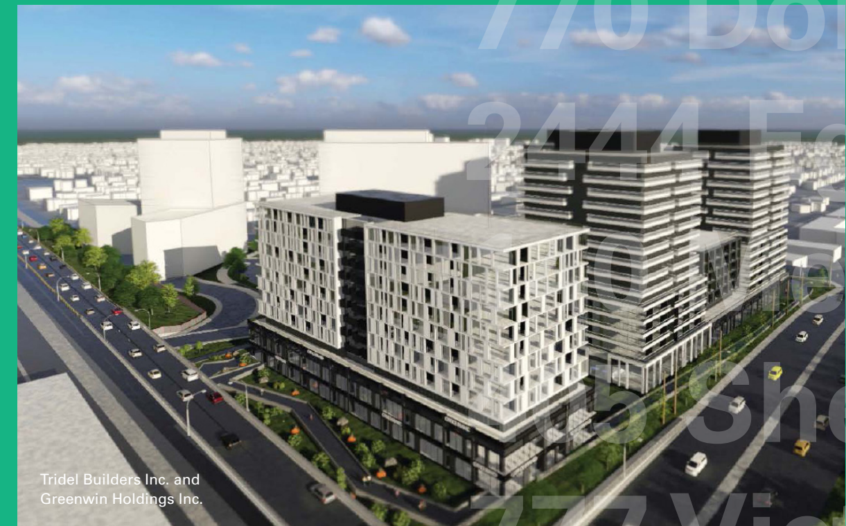
Tridel Builders Inc. and Greenwin Holdings Inc.

Tridel Builders Inc. and Greenwin Holdings Inc. were awarded the contract to develop the 50 Wilson Heights Housing Now site. Once complete, the development will also include a new park, commercial/retail uses, a child care centre, new public streets, improvements to the public realm and a community space for non-profit organizations.