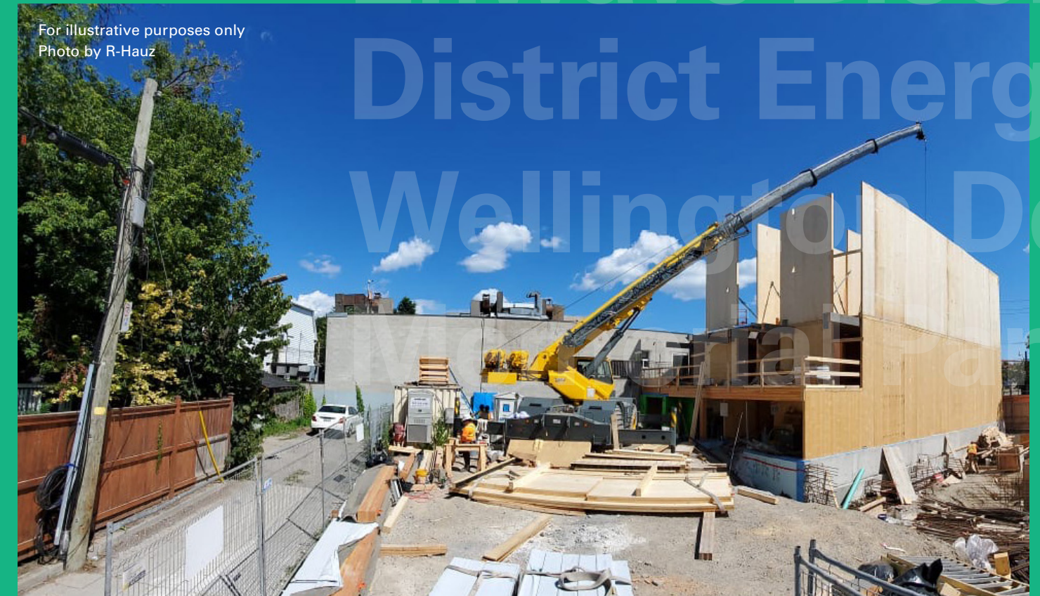
For illustrative purposes only

For a full list of projects, visit createto.ca