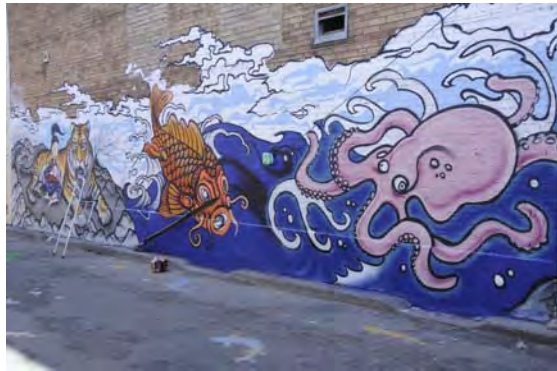
This year the Makover included graffiti removal and creation of art murals.