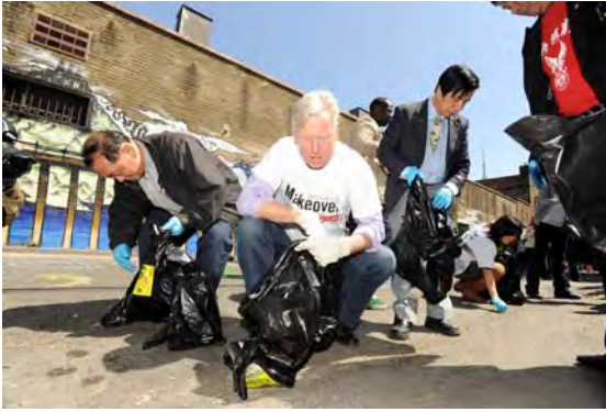
Let the Makeover begin!