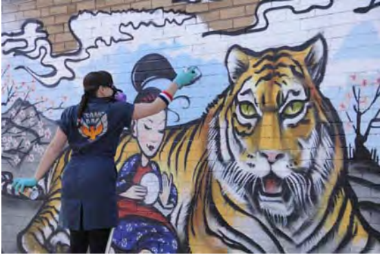
Artists at work.