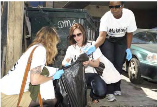
Getting to the job at hand.