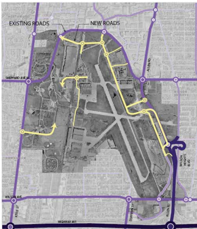
existing secondary plan proposed roads

YOU! Please provide feedback on the options shown in the following panels.