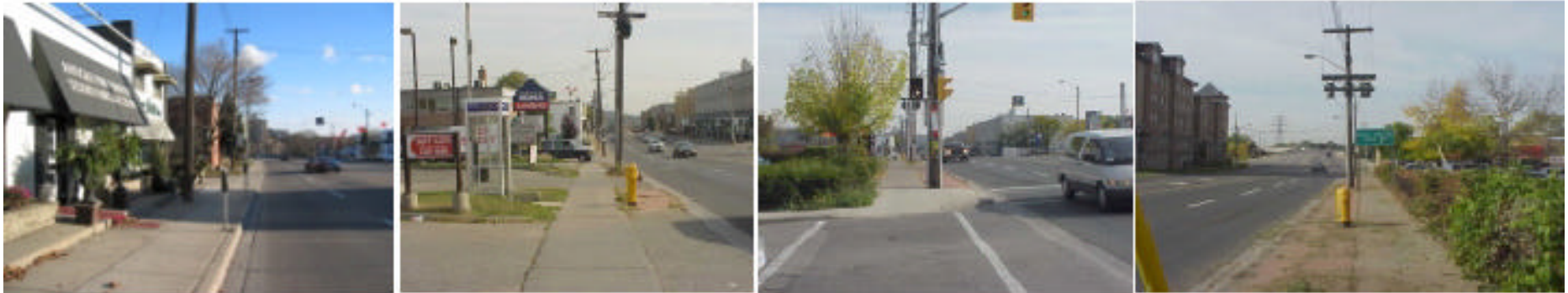
Dundas, North Side