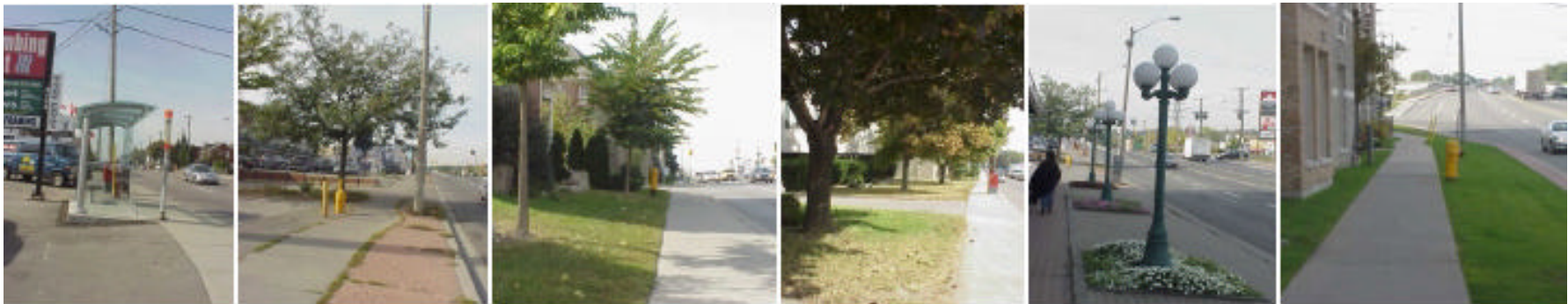
Dundas, South Side