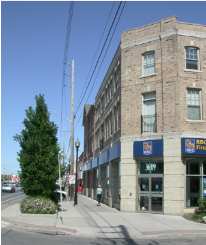
Lake Shore Blvd. W. & 35 th Street