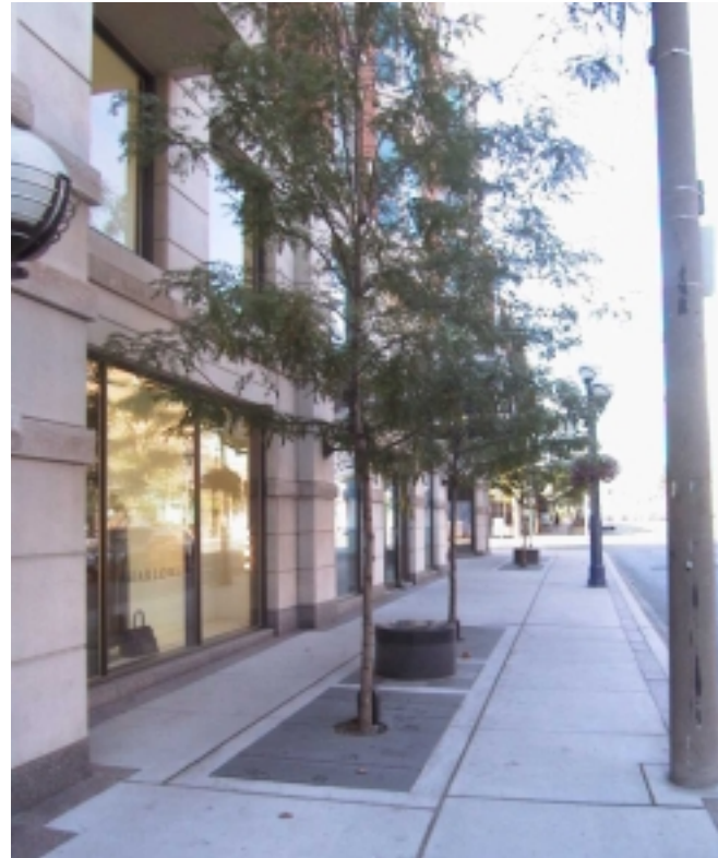
Avenue Road north of Prince Arthur