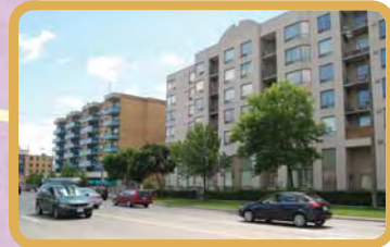
ROADS PROVIDE CONNECTIONS THROUGH THE NEIGHBOURHOOD BETWEEN KEELE ST AND SHEPPARD AVE AND ENABLE DIRECT LINK TO NATIONAL PARK