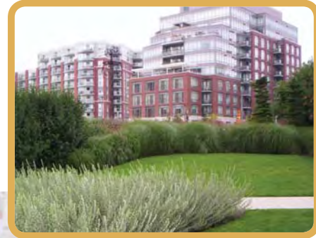
MIXED USE AREAS PROVIDE A TRANSITION FROM EMPLOYMENT AREA TO THE NORTH TO THE PROPOSED RESIDENTIAL NEIGHBOURHOOD DIRECTLY SOUTH