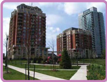
TRANSIT CONNECTS WILLIAM BAKER TO THE NEW SUBWAY STATION