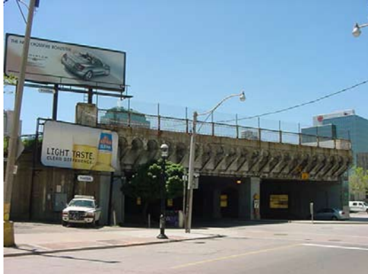
The intersection of Yonge Street and The Esplanade.