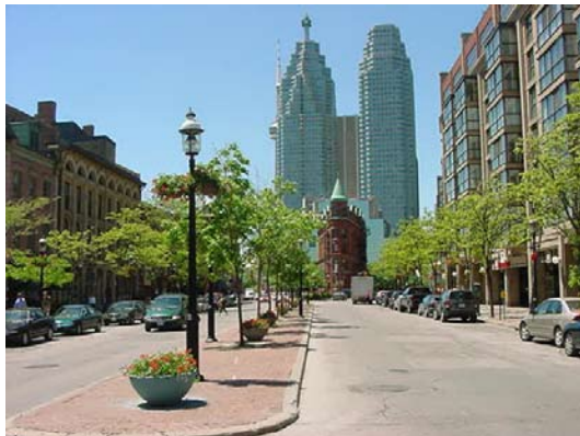
High quality streetscaping along Front Street.