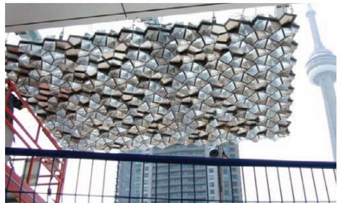
Canopy installation, United Visual Artists - Maple Leaf Square