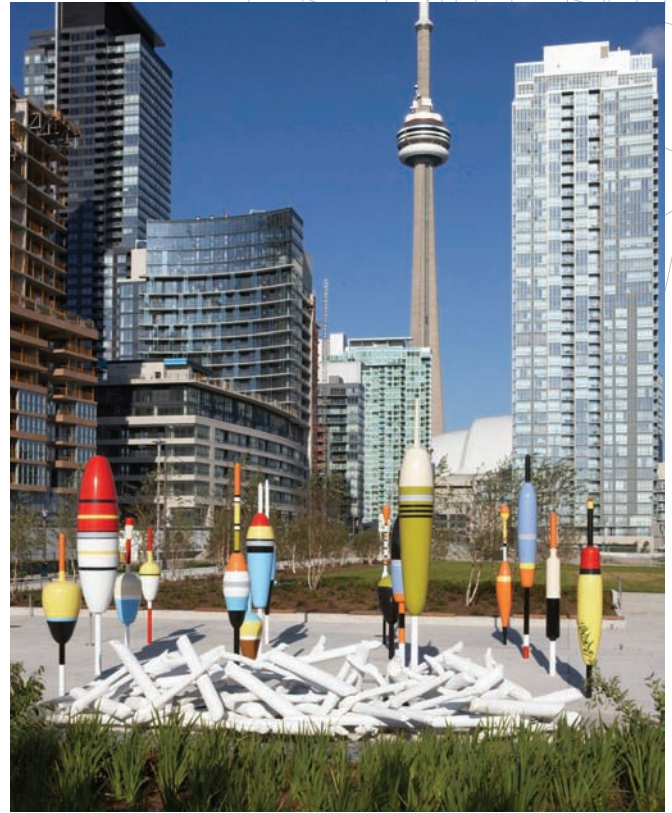
Canoe Landing Park, Douglas Coupland - City Place