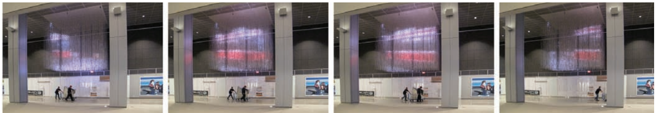
Wall installation, Michael Awad - Telus House Toronto