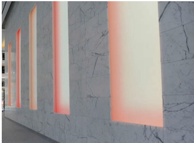
"Straight Flush", James Turrell - Bay Adelaide Centre