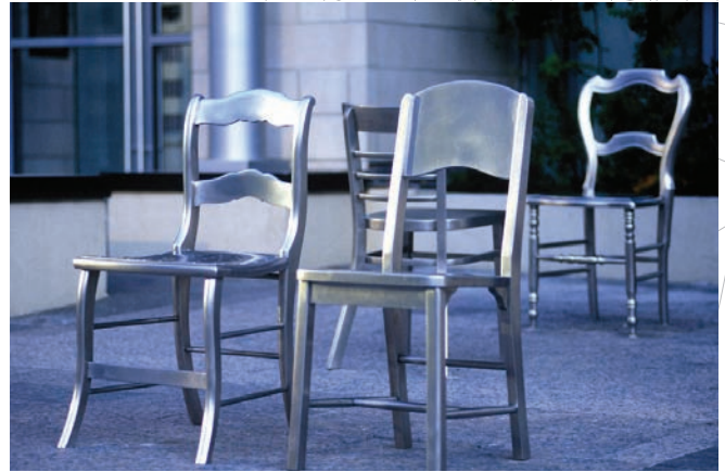
"Fairgrounds", Michel Goulet – Icon Condominiums

In other words, a public art plan identifies “how” the program will evolve, and not “what” the art will actually be. Figure 3 outlines in detail, the eight components of a public art plan.