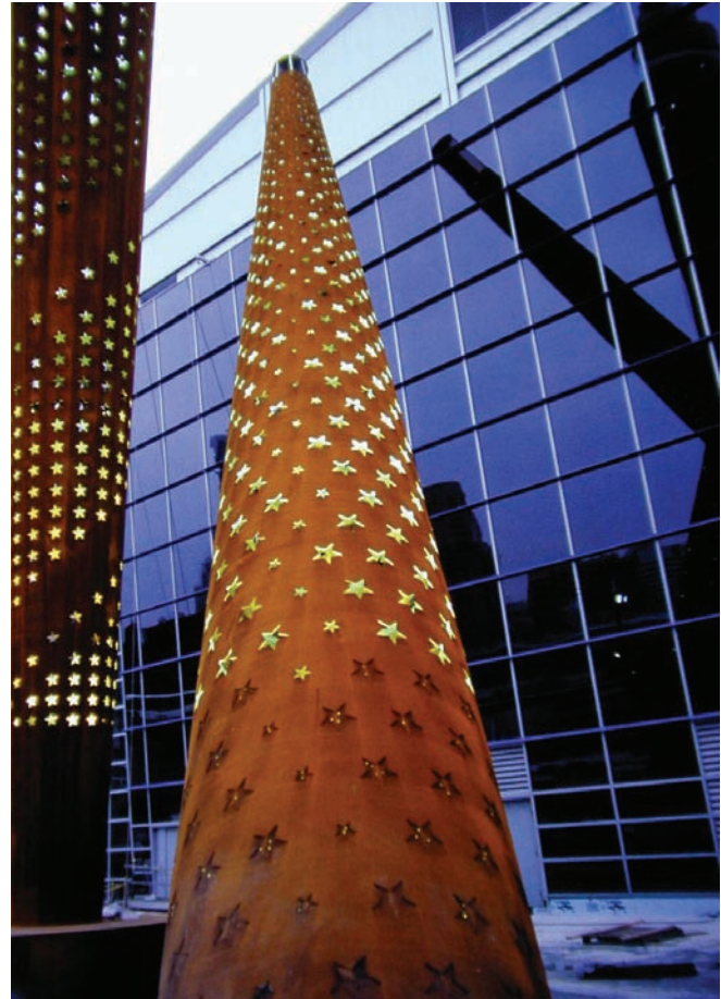
"Search Light, Star Light, Spotlight", John McEwen – Air Canada Centre

The general approach followed by City Planning to secure public art contributions is outlined in Figure 2. The individual steps are discussed in greater detail over the following pages.