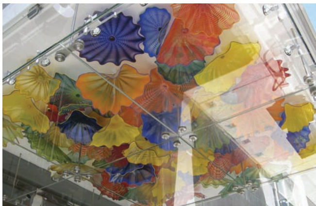
"Untitled", Dale Chihuly – Soho Grand Hotel