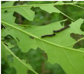
Damage from young caterpillar

Young caterpillars chew small holes on the upper surface of leaves. Older larvae may eat entire leaves, except the major veins. Caterpillars disperse on silk threads to be carried by the wind to other trees. Most deciduous trees can withstand only one or two consecutive years of defoliation. Repeated leaf loss stresses trees and can lead to their death. During outbreaks the caterpillars are an extreme nuisance; trees lose their foliage, caterpillars crawl everywhere, and their droppings rain from trees.