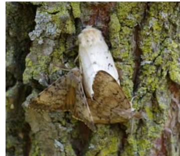
Female (white) and male (brown) moths

Caterpillars hatch from overwintering eggs in mid-spring. They feed on tree leaves at night for about 7 weeks. In mid-summer the caterpillars pupate in sheltered areas. Adult moths emerge about two weeks later in early August. Soon after mating, females lay oval shaped egg masses on tree limbs, rocks, buildings, vehicles, and other sheltered areas.