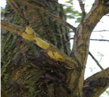
Egg masses and pupal cases

There are four stages in the development of this insect: egg, caterpillar, pupa and moth.