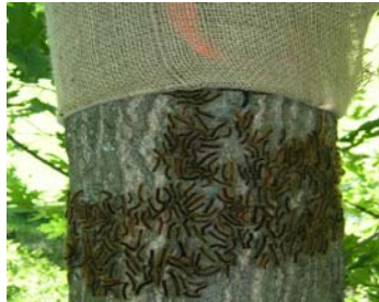
Caterpillars under the burlap