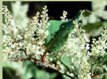
Japanese knotweed is considered a noxious weed and is present in the ravine.

An increase of invasive species will ultimately cause biodiversity in the ravine system to decline. Removing aggressive non-native trees and shrubs can enable plants, which naturally thrive in this environment, to return and flourish. This will enable plant species that are of conservation concern to make a comeback, ensuring their survival into the future. By removing trees that do not naturally grow in this environment, future risk of those trees becoming a hazard will be reduced.