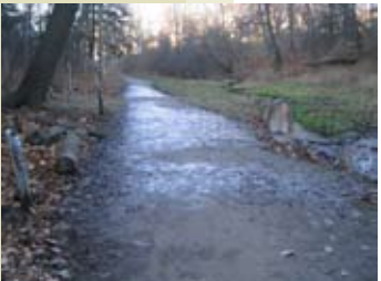
Seepage can cause muddy and icy conditions.

The consultant team, will be exploring solutions to reduce muddy/ icy trail conditions caused by seepage as well as options to protect important and sensitive groundwater discharge features.