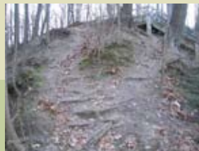
Trampling causing erosion and exposure of tree roots.

A number of impacts are threatening the health of the forest habitat and are creating safety concerns to those who use the ravine for recreation. These include: