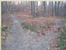
Multiple side trails.

Many native plants require specific conditions to thrive. Some require lots of light and moisture, others grow well in shady, cool environments. Glen Stewart Ravine supports a large number of plant species that are specifically adapted to habitats, which in turn provide food and nest sites for different types of insects, birds and other animals. These species contribute to the ravine's biodiversity and are an indication of ecological health and sustainability with their presence. Unfortunately, there are signs that the biodiversity within the ravine is rapidly declining. There are many factors that are contributing to this and many are human induced. If left unattended, these impacts may result in the loss of habitat and the wildlife that depends on it.