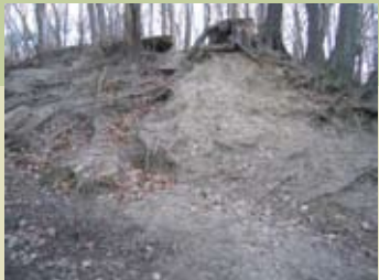
Erosion can destabilize trees and slopes.

Soil erosion becomes a problem when people walk over the forest floor which is normally covered with plants that grow low to the ground. This vegetation, consisting of shrubs and wildflowers is very important to the survival of a forest. Plants that grow in the soil, sustained by recycled nutrients from decaying twigs and leaves, help retain moisture, keep the ground surface cool and help stabilize soils with their intertwined root systems. Trampling caused by intensive use from people, bikes and dogs compacts soils and kills plant root systems. Bare slopes where tree roots are exposed occur where the understory has been trampled and soil has been washed away. This erosion and soil compaction can destabilize trees, posing a safety hazard to people using trails. The consultant team, will be looking at ways to address soil erosion in the ravine. You can also help by respecting the sensitivity of small plants trying to regenerate in the forest understory and walk on designated trails only.