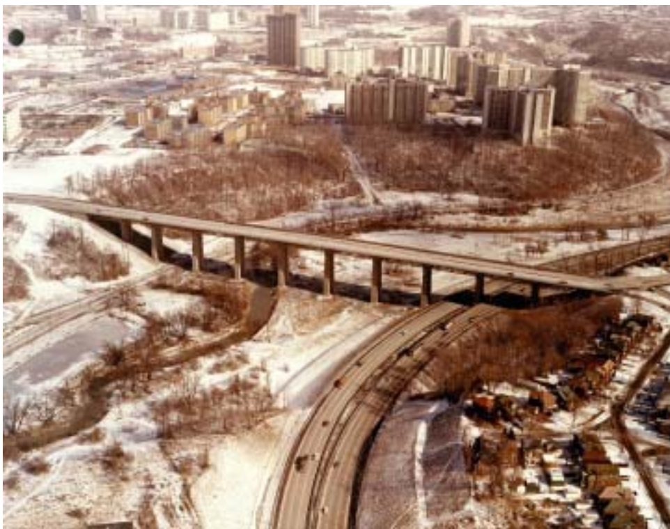
Leaside Bridge - Photo Circa 1960's