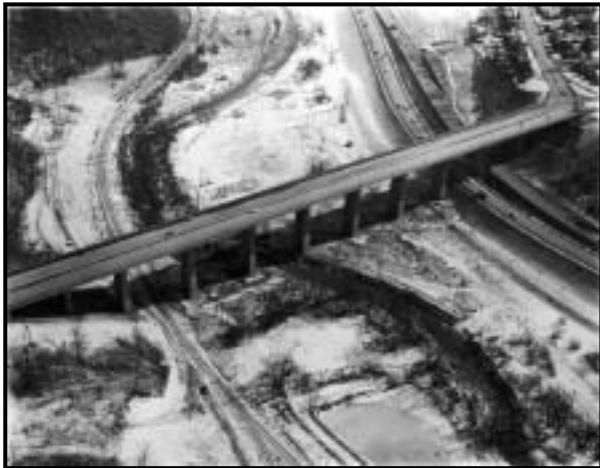
Aerial photo of the Leaside Bridge, spanning the Don Valley, Circa 1959