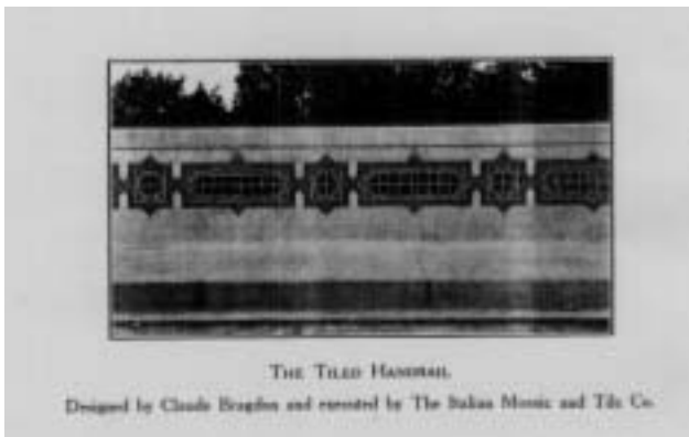
Photo copy of handrail from historic brochure, left,