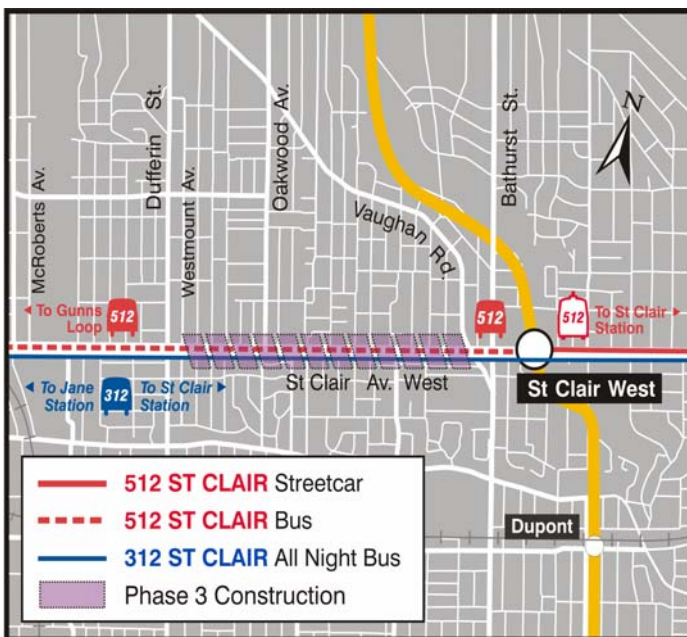
512 St. Clair Route Service Effective until further notice