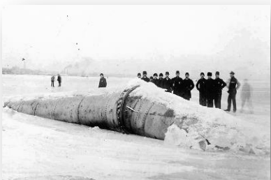
Break in water supply pipe under bay (c. 1893)