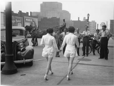
Women in shorts "cause" car to crash into pole (c. 1937)