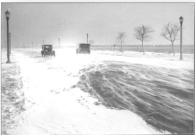
Lakeshore Boulevard, Toronto during a snowstorm. (c. 1925)

1929 ► October 29, Stock market crashes marking the beginning of Great Depression