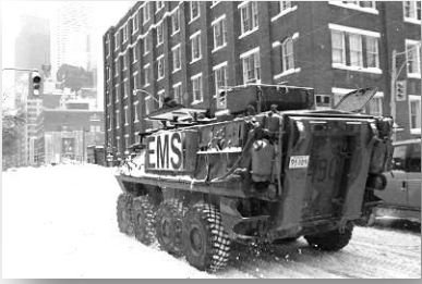
Canadian Forces Bison armoured personnel carrier drives into Toronto downtown core