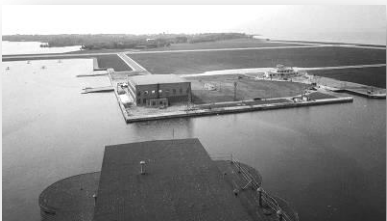
Toronto Island airport from roof of grain elevators (c. 1939)