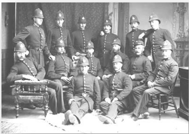
Members of Toronto Police Force (c. 1883) Library and Archives Canada Topley Studio Fonds, Item E-43956