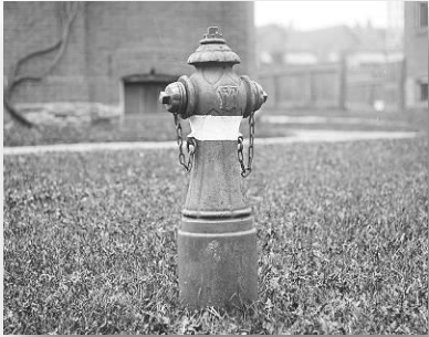
Hydrant — 4" (c. 1918)