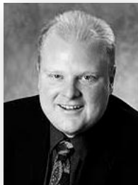
Robert Ford Toronto Mayor 2010 – Current