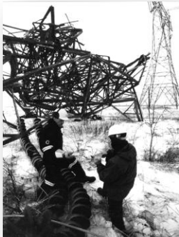
Hydro-Quebec pylon collapsed under the weight of the ice, near Drummondville, Quebec