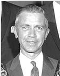
Donald D. Summerville Toronto Mayor 1963