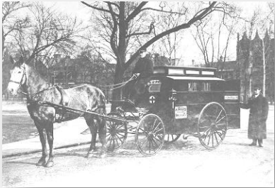
H. Ellis private ambulance (c. 1905)