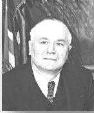
Leslie H. Saunders Toronto Mayor 1954 – 55