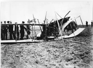
Wreckage of first Toronto airplane crash

1911 ► Toronto Harbour Commission (THC) is formed to manage Toronto harbour and waterfront lands