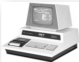
Commodore PET Computer