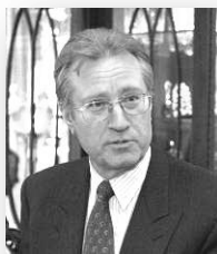
Art Eggleton Toronto Mayor 1980 – 91

1979► Metropolitan Toronto Emergency Planning Committee established.