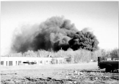
Hickson Fire, Scarborough