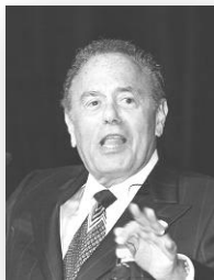
Mel Lastman Toronto Mayor 1998 – 03