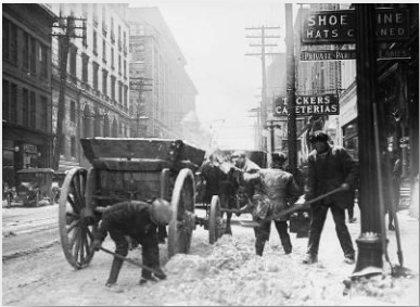
Snow shovellers, Queen St. (c. 1922) Toronto Archives Fonds 1266, Item 58