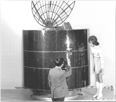
Anik A Satellite