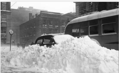
Toronto Snow Storm 1944