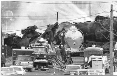
Mississauga Train Derailment