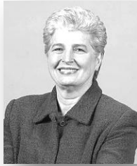
Barbara Hall Toronto Mayor 1994 – 97