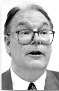
John Sewell Toronto Mayor 1978 – 80