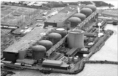
Pickering Nuclear Generating Station