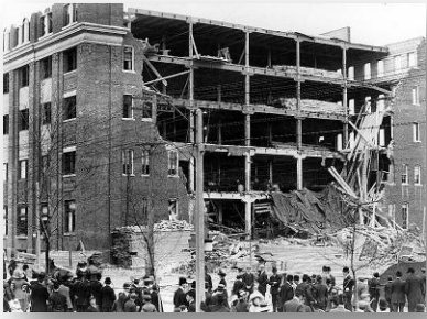
Collapse of Neilson's building, Gladstone Avenue. Toronto Archives Fonds 1244, Item 7094

1909 ► Collapse of the Neilson Building The building was owned by Neilson, the Canadian chocolate and ice cream manufacturers.