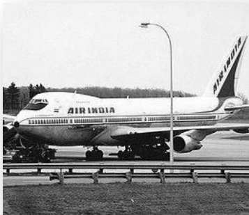
Air India Boeing 747, similar to the one used for Flight 182