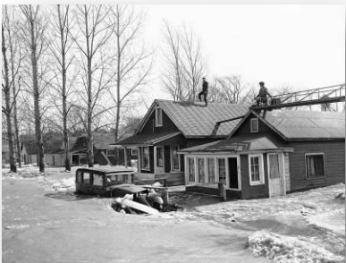
Hurricane Hazel Damage, 1954, Toronto Archives, Fonds 1257, Series 1057, Item 1997.