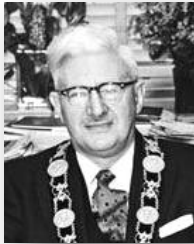
Nathan Phillips Toronto Mayor 1955 – 62