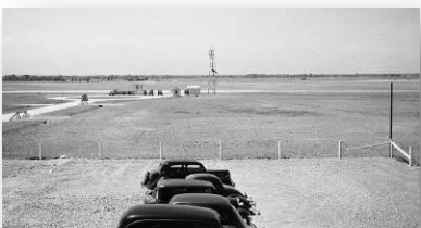
Malton airport (c. 1939)