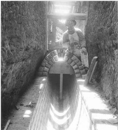
Avenue Road sewer (c. 1890)

1909 ► Collapse of the Neilson Building The building was owned by Neilson, the Canadian chocolate and ice cream manufacturers.