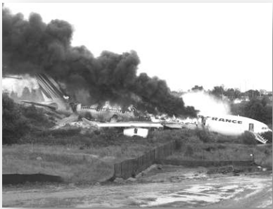
Crash of Air France Flight 358, Pearson International Airport, August 2, 2005