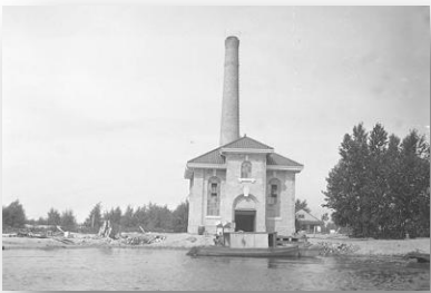
Island incinerator plant - exterior (c. 1915) Toronto Archives Fonds 200, Series 372, Subseries 70, Item 44