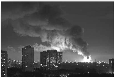
Explosion at Sunrise Propane Facility in Toronto, August 10 2008