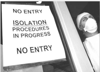
SARS Outbreak Toronto 2002-3

affecting more than five million people. In total, at least eleven people died.