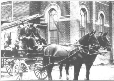
Horse-drawn fire wagon with ladder (c. 1907)