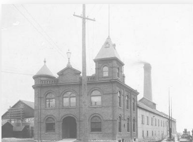
Power Plant of Toronto Electric Light Company, foot of Scott Street (c. 1897) Toronto Archives Fonds 1231, Item 1994