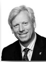
David Miller Toronto Mayor 2003 – 10