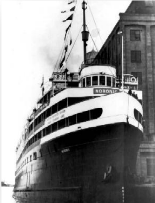
Steamship Noronic Toronto Archives Fonds 1244, Item 1429