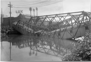
Eastern Avenue Gas Co. Bridge Collapse (c. 1929) Toronto Archives Fonds 200, Series 372, Subseries 84, Item 555