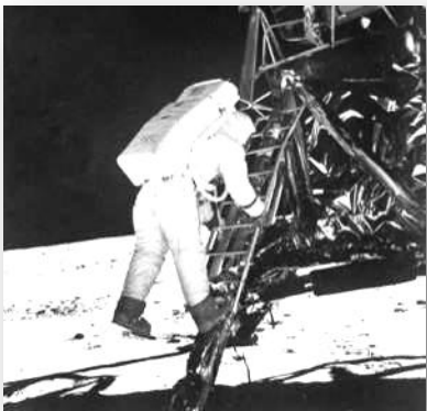
First Moon Landing