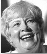
June Rowlands Toronto Mayor 1991 – 94