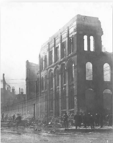
The Great Fire of 1904 Front St. west of Bay. Toronto Archives Fonds 1408, Item 4

1884 ▶ Toronto's First Electric Railway is built by John Joseph Wright and Charles Van Depoele from the Toronto Street Railway's King-Exhibition horse-drawn rail terminal line at Strachan Avenue into the CNE, a distance of about a mile.