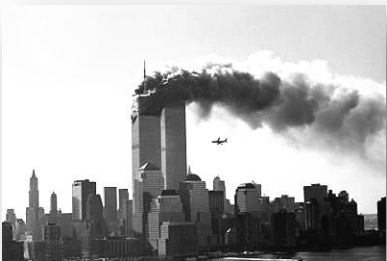
9/11 Terrorist Attack