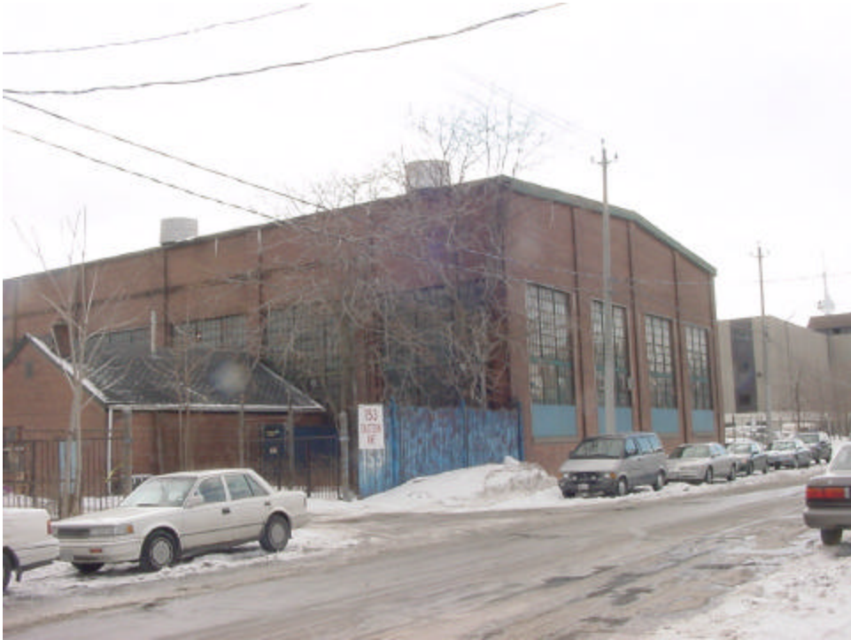
above: 153 Eastern Avenue