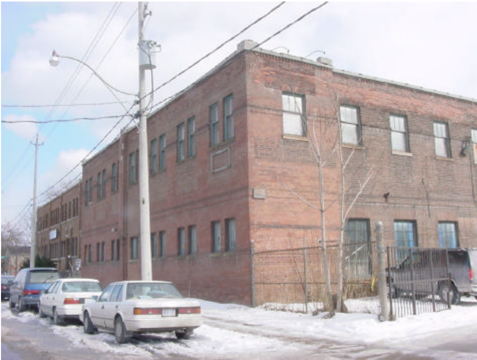
above: 169 Eastern Avenue (right)