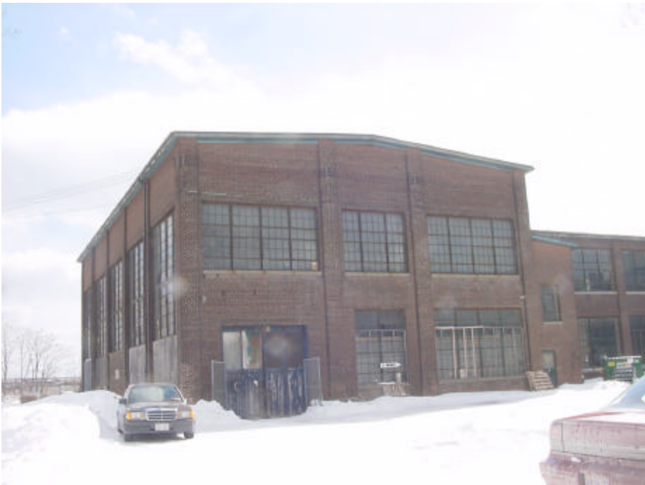
above: 185 Eastern Avenue (rear)