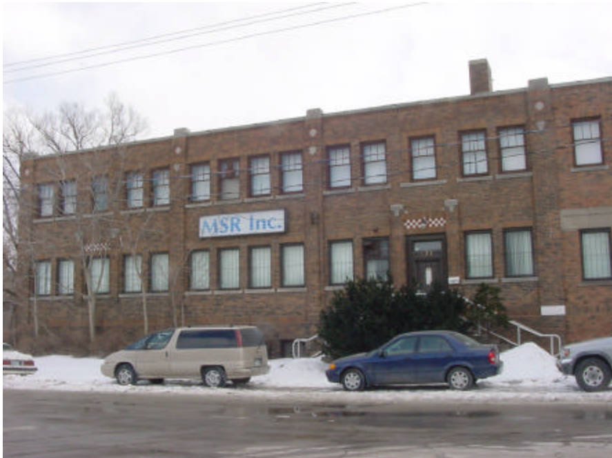
above: 171 Eastern Avenue