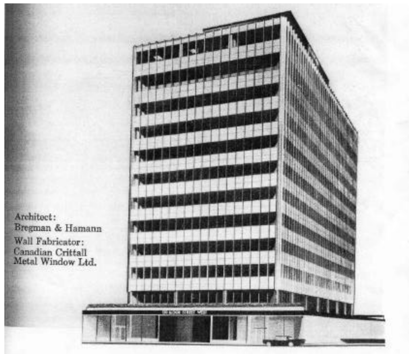
Illustration of CIL Building from Canadian Architect , March 1960