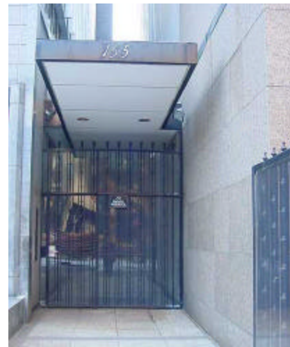
Detail of Entrance with Grille