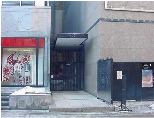
Entrance on Cumberland Street with Fence