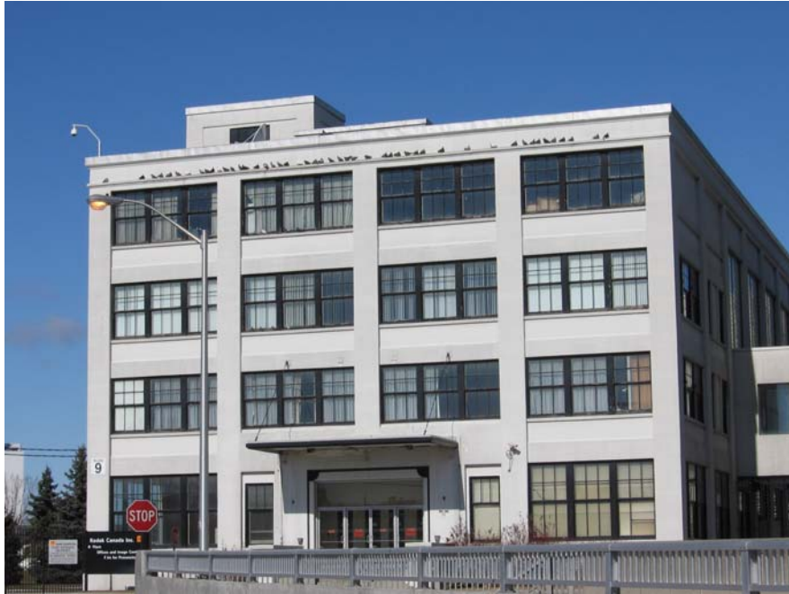
Employees' Building (also known as Building No. 9), Canadian Kodak Company, showing the principal (south) façade

PHOTOGRAPH: 3500 EGLINTON AVENUE WEST ATTACHMENT NO. 2