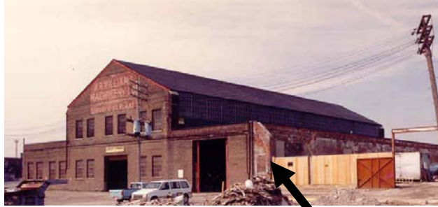
former Central Prison Paint Shop wall visible on right