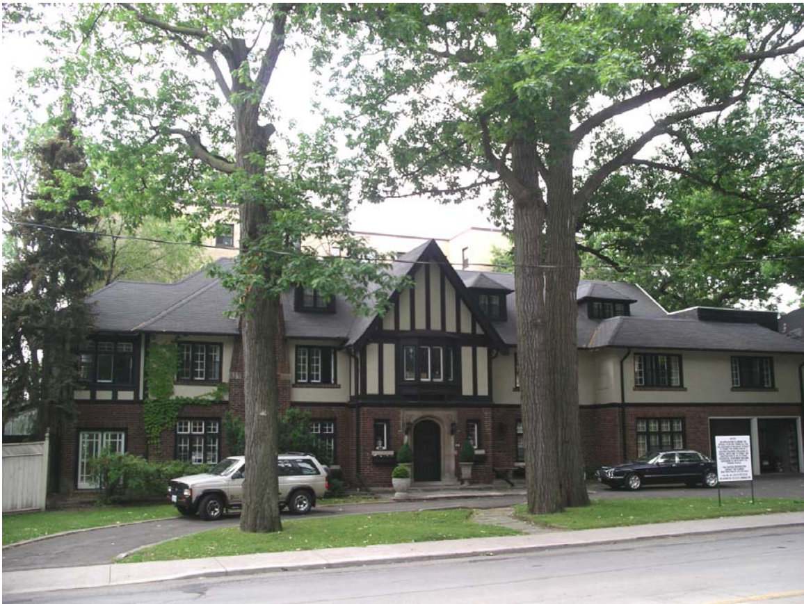
215 Lonsdale Road (north façade)