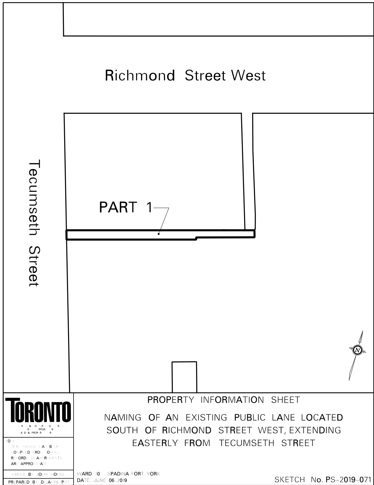
Figure 1: Property Information Sheet for Public Lane