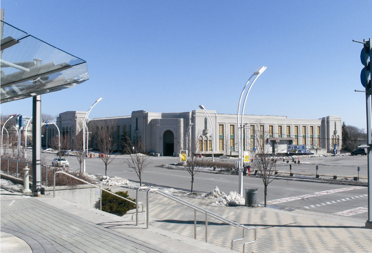
Composite view from the steps of the Direct Energy Centre