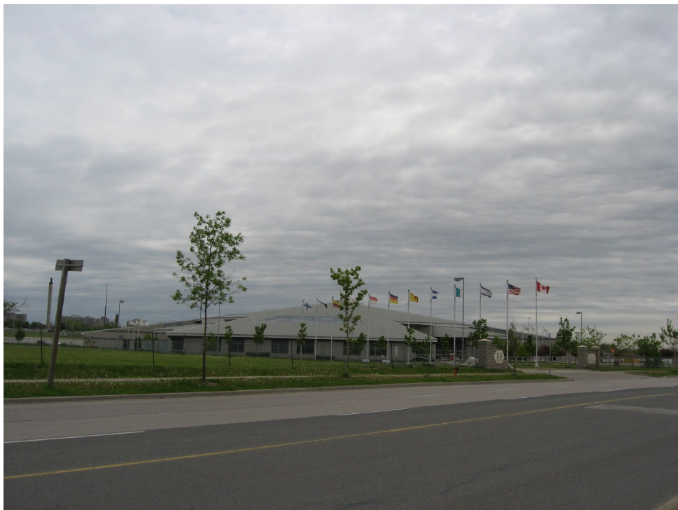
Looking east south from across the road at 1111 Arrow Rd