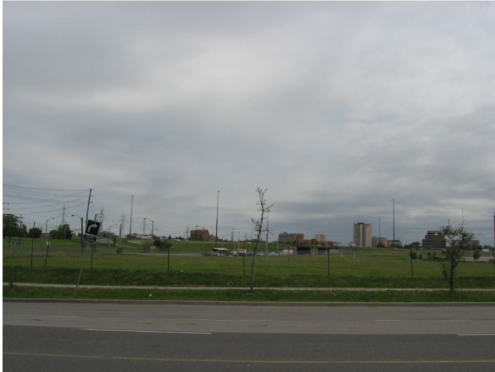
Looking east from across the road at 1111 Arrow Rd