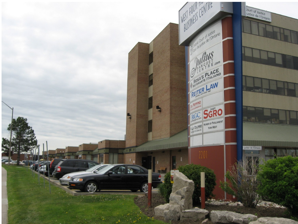
Looking at the east side of the commercial property directly across the road from 1111 Arrow Rd