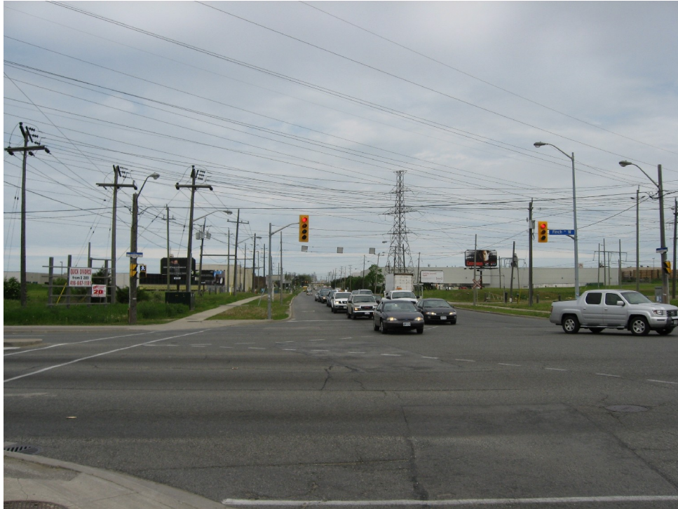
Looking north from across the road at 1111 Arrow Rd