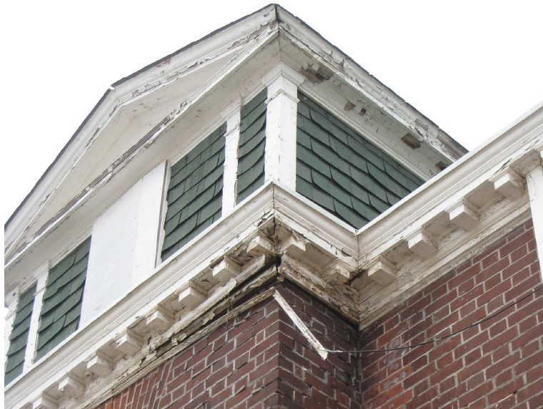
5 Avonwick Gate, March, 2009