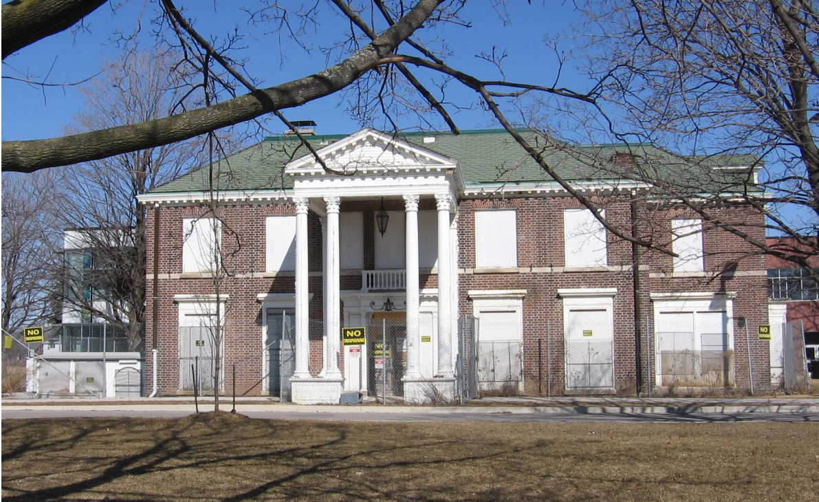
5 Avonwick Gate, 2003