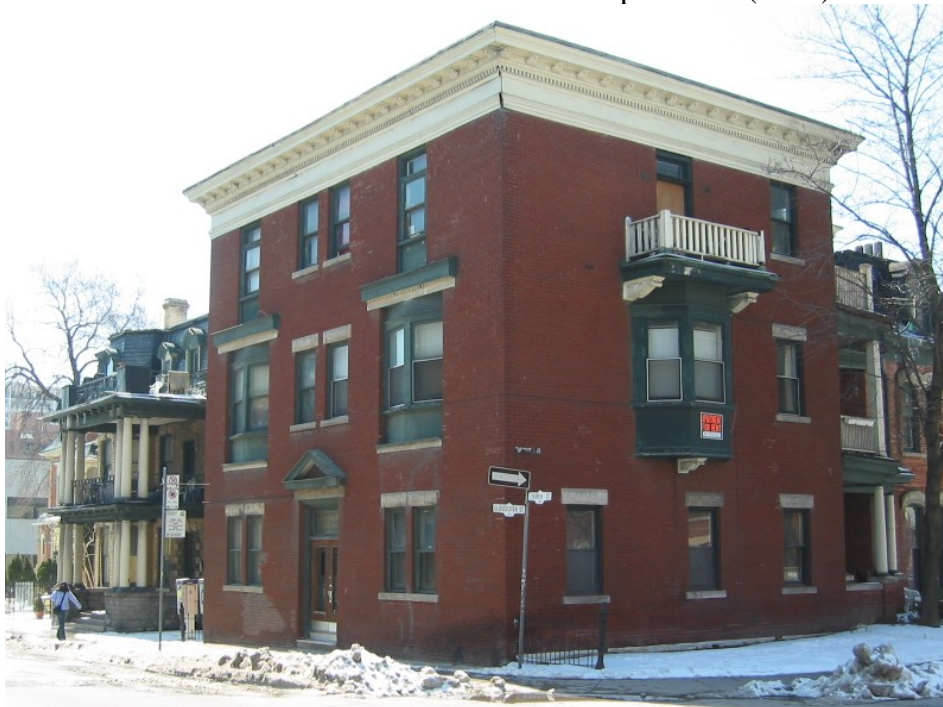
596 Church Street: Gloucester Mansions (1911)