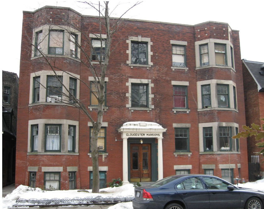
67 Gloucester Street: Gloucester Mansions (1911)