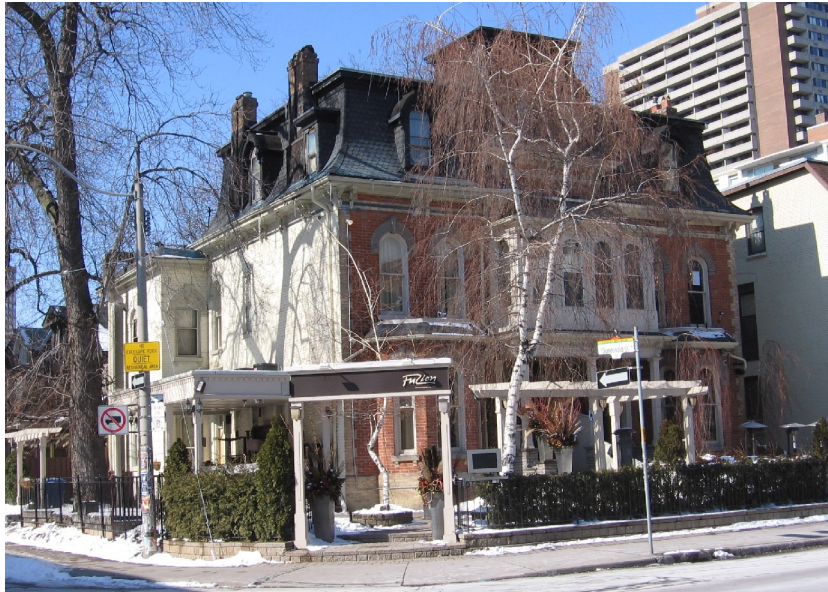
580-582 Church Street (northwest Dundonald Street): listed on City's heritage inventory