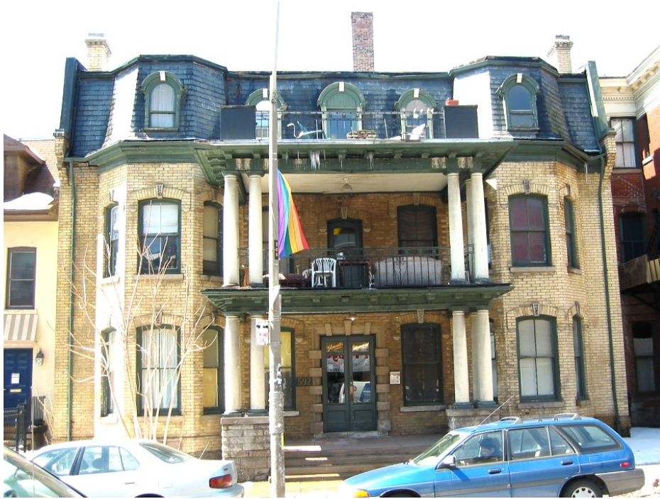
592 Church Street: Wallace Millichamp Houses (1873)