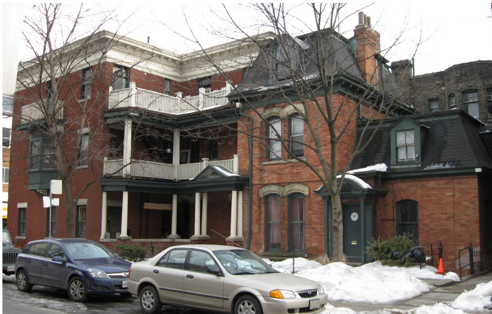
69 Gloucester Street: Wallace Millichamp House (1875) – centre of photograph