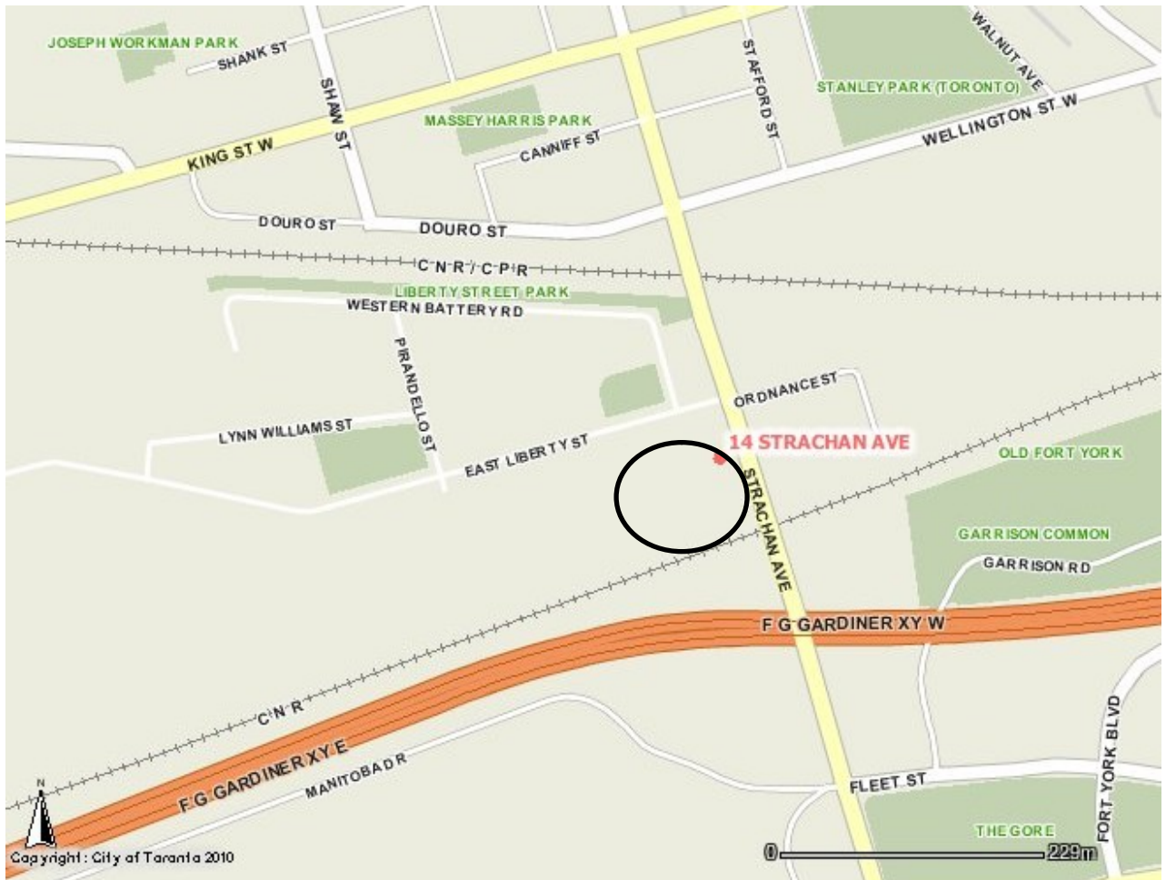
Appendix "A" - Release of Section 30 Agreement – Lands on West Side of Strachan Avenue