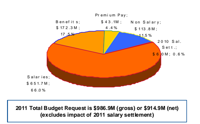
Figure 1 - Overall Budget Request

salaries and benefits. The remaining 11.5% is required for the support of our human resources in terms of the vehicles, equipment and information they use, facilities they work in, and training they require.