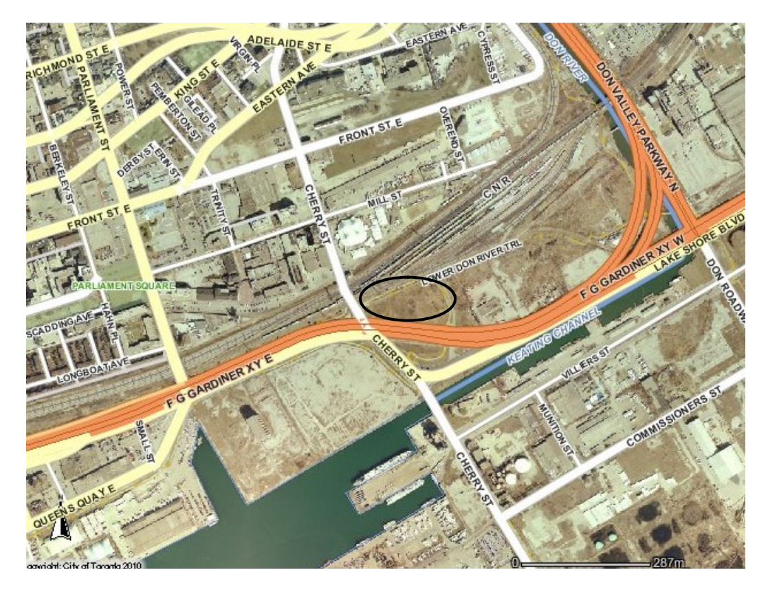
Staff report for action on Leases, Licences, and Land Transfers - West Don Lands