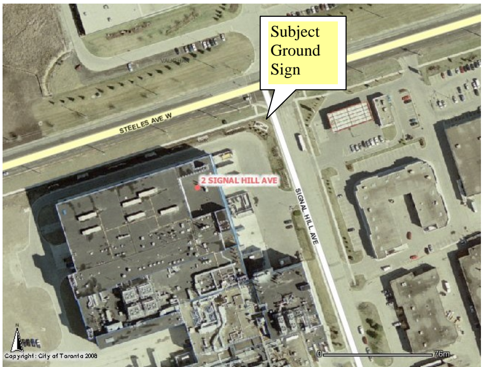
\label{eq:Appendix B-Renewal of Encroachment Agreement on a City Easement at Signal Ave and Steeles Ave \\West