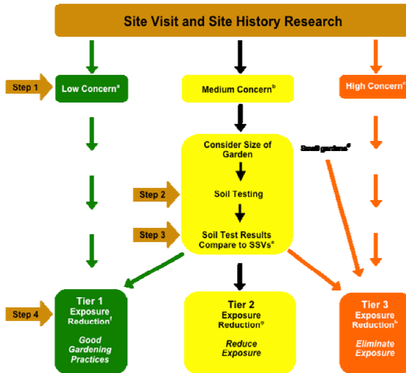
Figure A.1: Soil Assessment Guide for New City Allotment and Community Gardens