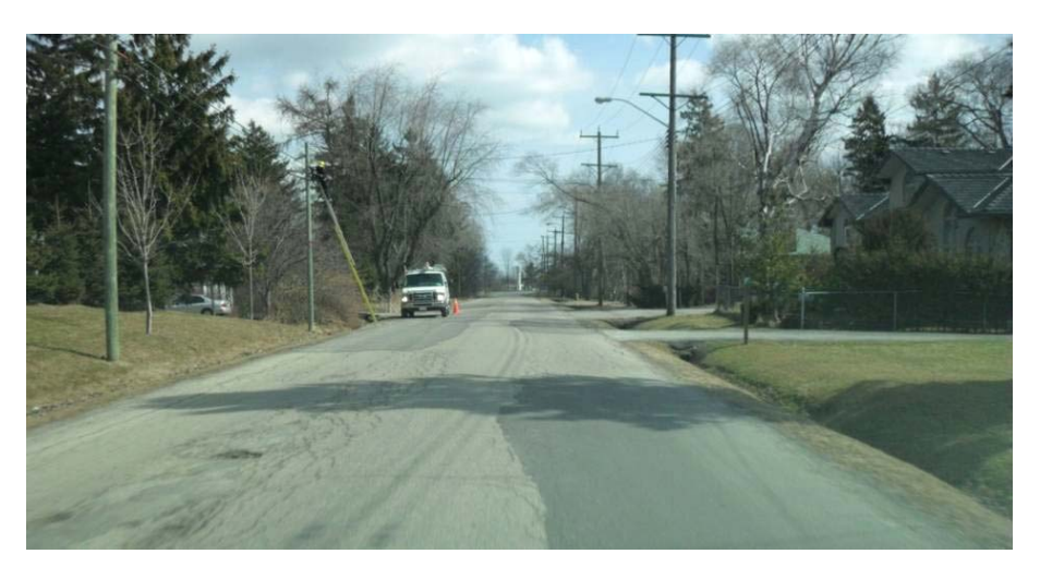
Figure 3. Alligator Cracking and Patching on Beechgrove Drive

Beechgrove Drive (east of Coronation Drive) would significantly accelerate pavement failure. Mitigation may require reconstruction of Beechgrove Drive (east of Coronation Drive). (The cost of reconstruction would likely be over $250,000. This is based on length and typical cost per kilometre only. A refined cost estimate would require geotechnical information, survey, assessment of drainage, collection of utility data, and so forth – which is beyond the scope of this review.)