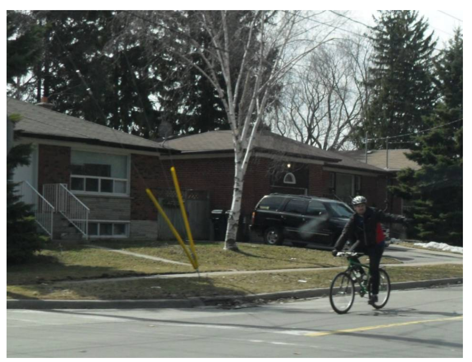
Figure 20. Cyclist on Manse Road

Coronation Drive from Manse Road to Morningside Avenue is a designated cycle path.