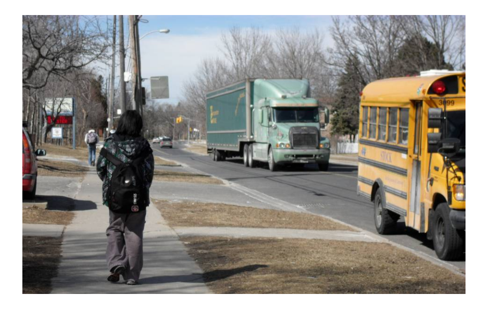
Figure 9. Existing Commercial Truck on Manse Road