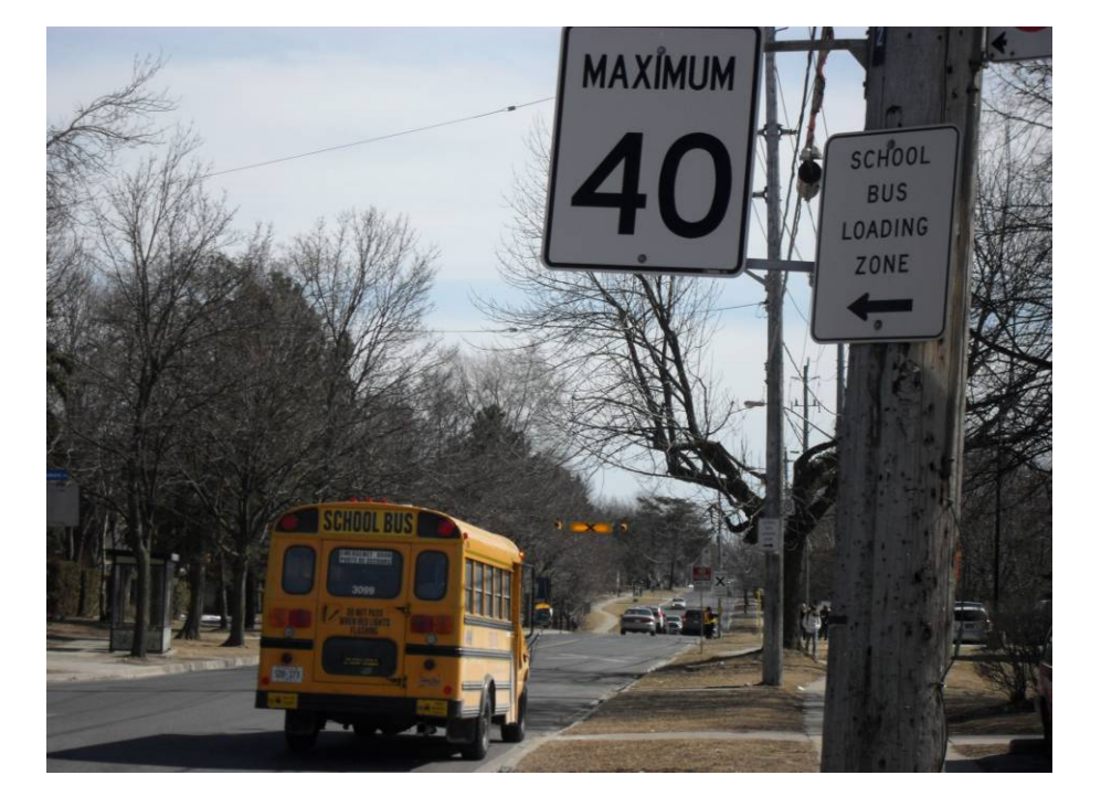
Figure 16. School Bus Loading Zone and Crossing on Manse Road