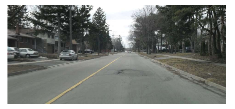
Figure 4. Utility Patch on Coronation Drive West of Manse Road