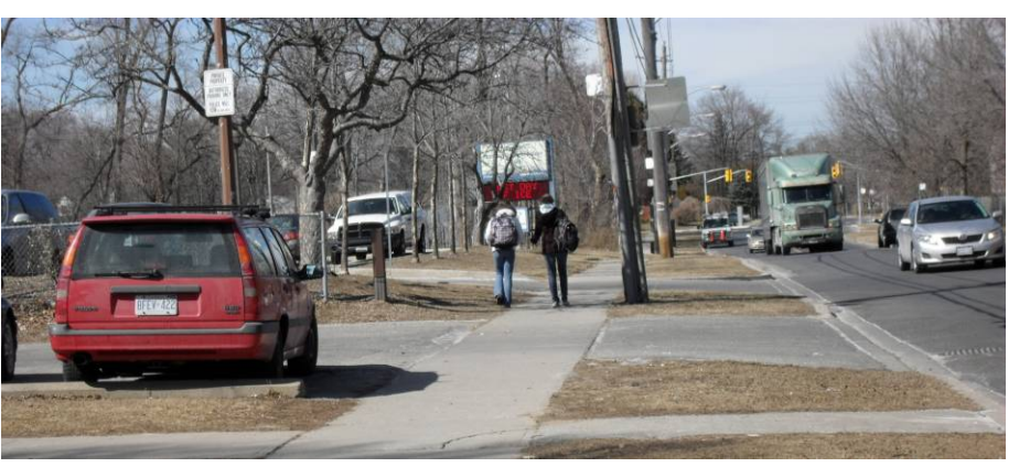
Sidewalks are in place on both sides of Manse Road, Coronation Drive west of Manse Road, Lawrence Avenue, and Morningside Avenue. During field reviews, many pedestrians were seen on sidewalks along all the subject roadways.

Coronation Drive from Manse Road to Morningside Avenue is a designated cycle path.