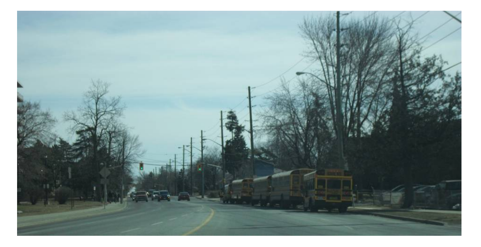
Figure 13. Joseph Brant Senior Public School on Manse Road