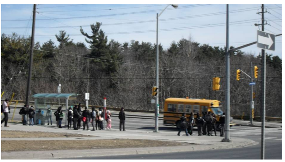
Centennial College Morningside Campus and nearby West Hill Collegiate Institute generate hundreds of pedestrians who walk along Morningside Avenue and use bus stops along and adjacent to Morningside Avenue.

Morningside Avenue is a busy roadway. As such, the addition of four to five trucks would hardly be noticeable, except for two concerns.