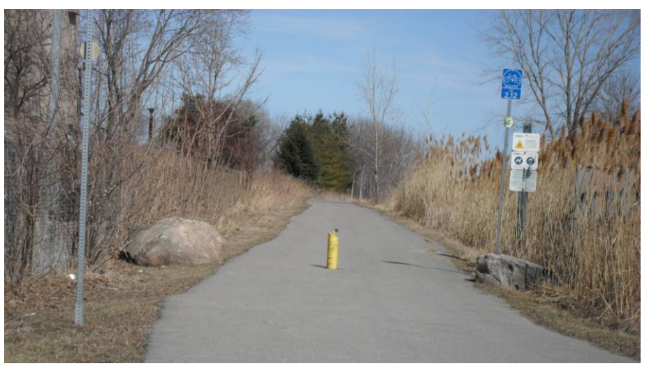
Immediately to the north of this cycle trail (to the left in this photo) is the location where the biosolids would be loaded into trucks. Loading would typically take place during early morning hours.