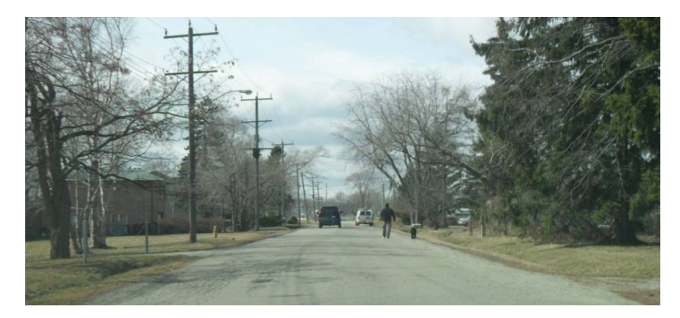
Figure 17. Pedestrian along Beechgrove Drive

There are no sidewalks along Beechgrove Drive leading from the Plant, and no sidewalks along the light industrial area of Coronation Drive. Along Beechgrove Drive, pedestrians walk in the street. Along Coronation Drive west of Manse Road, pedestrians were typically observed walking in the grassy area behind the curb. (A TTC bus route serves this portion of Coronation Drive, and a number of the pedestrians observed during the two field reviews were walking to or coming from bus stops.)