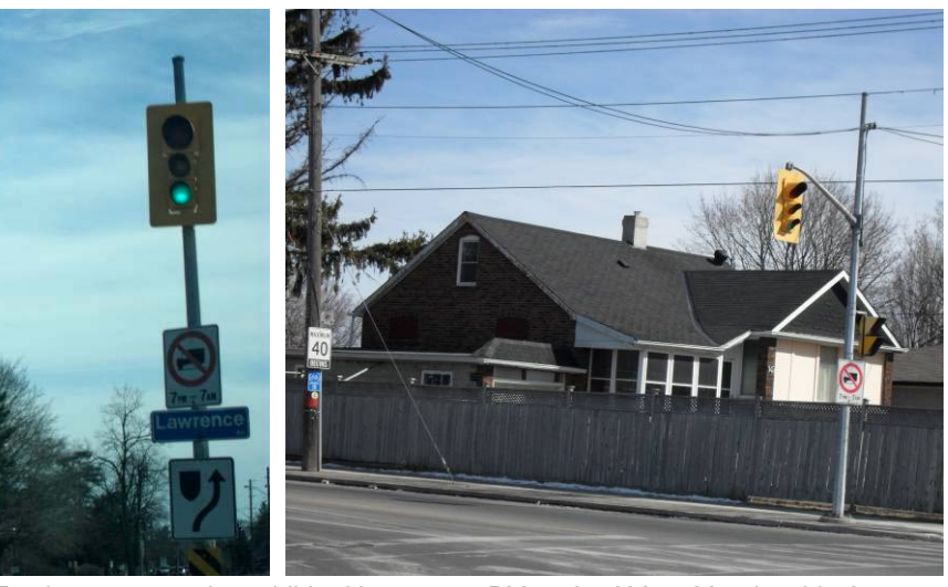
Figure 24. Truck Restrictions

If Coronation Drive to Morningside Avenue was selected as the haul route, the impact on truck restrictions will need to be examined. Trucks are typically loaded early in the morning (between 4:00 and 6:00 AM) with truck departing toward London before 7:00 AM (to avoid congestion on Highway 401 since delays due to congestion increase the cost of hauling the biosolids).