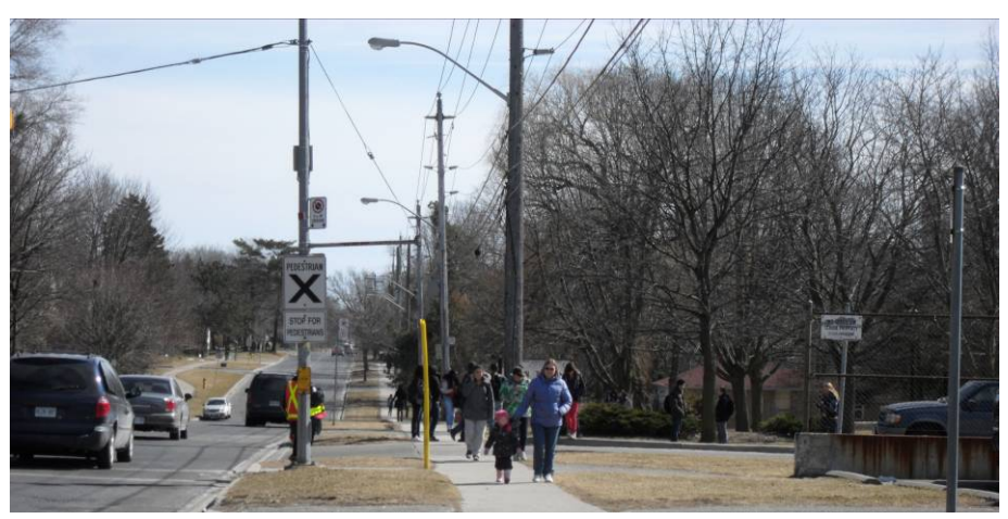
Pedestrians near the schools on Manse Road, Coronation Drive, and Morningside Avenue include small, kindergarten-age children.

With the current operation, hauling of ash is performed during one week per year and can avoid "spring thaw" conditions when the Beechgrove Drive base may not support heavy loads. With daily hauling of biosolids, hauling during the "spring thaw" cannot be avoided.