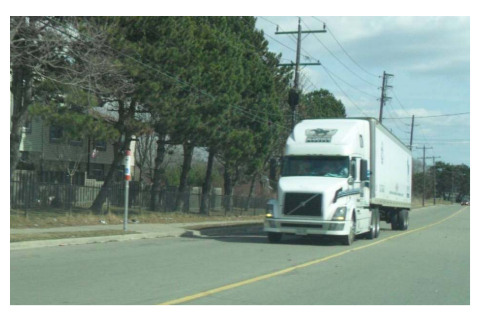
Figure 7. Existing Commercial Truck on Coronation Drive

The heavy commercial trucks observed did not exhibit problems negotiating any portions of the roadway network leading from the Plant to Lawrence Avenue. The curve north of the Plant is sharp, but well signed for 20 km/hr. The intersection of Coronation Drive and Manse Road is offset, but trucks were observed passing through the intersection without problem. For the movement from westbound Coronation Drive to northbound Morningside Avenue, large trucks must "swing wide" to negotiate the turn ( Figure 8 ).