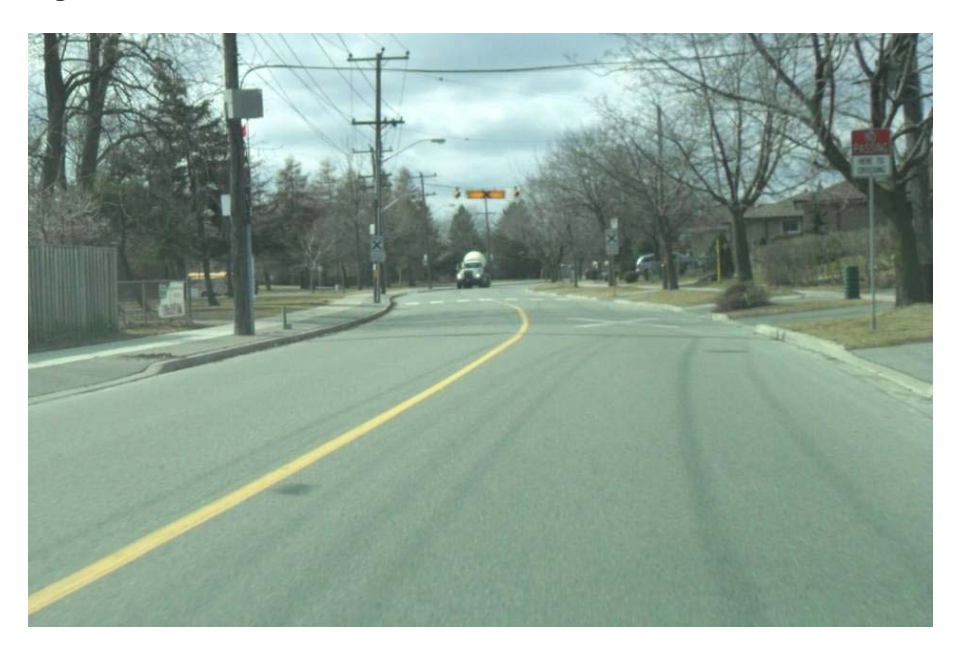
Figure 6. Pavement on Morningside Avenue