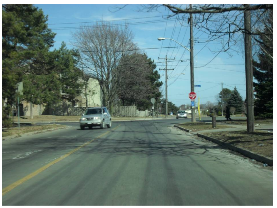
The intersection has an offset of approximately 8 metres, but this had no impact on trucks passing through this intersection.

Hauling of biosolids would be accomplished with specialized trucks and trailers. These combinations have 4-axle or 5-axle dump trailers with an