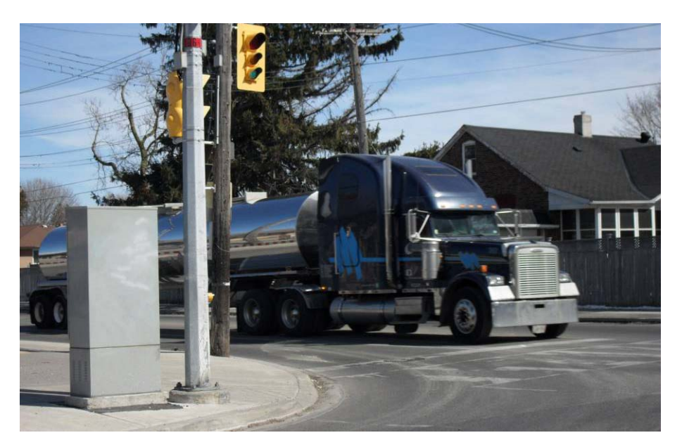
Figure 8. Truck Turning Coronation Drive to Morningside Avenue