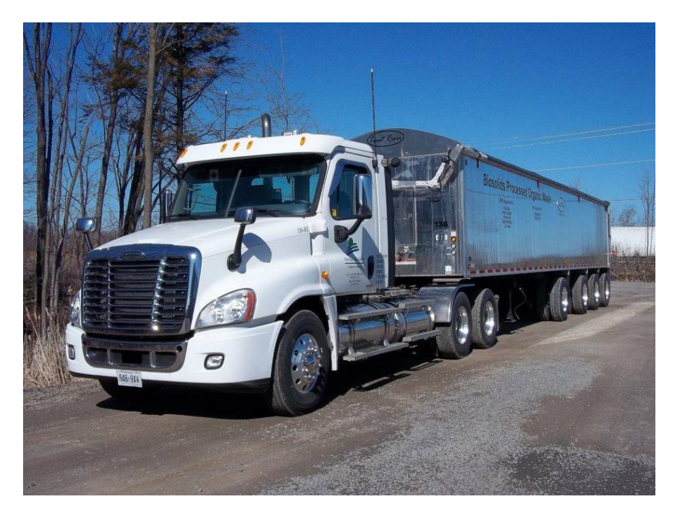
Figure 11. Typical Haul Truck for Biosolids

overall length between 20 and 22 metres. (See Figure 11 .) Similar size trucks were observed during field reviews using Coronation Drive, Morningside Avenue, and Manse Road.