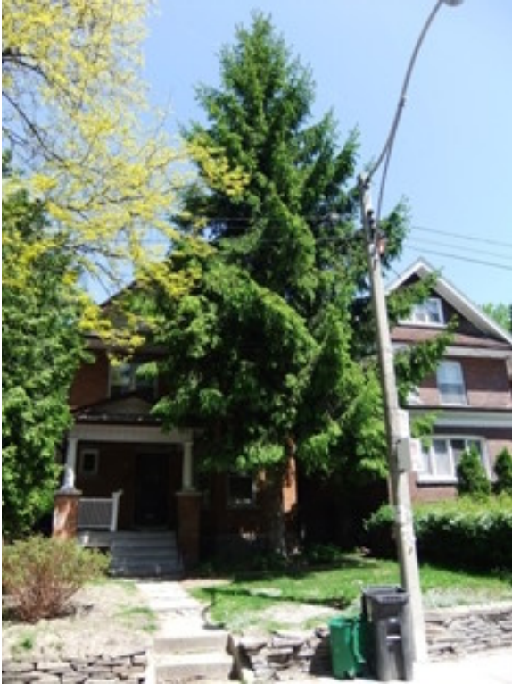
white spruce, image 1