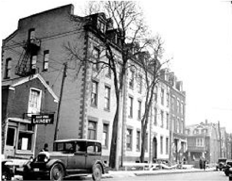
Archival Photograph, showing Walnut Hall in 1934