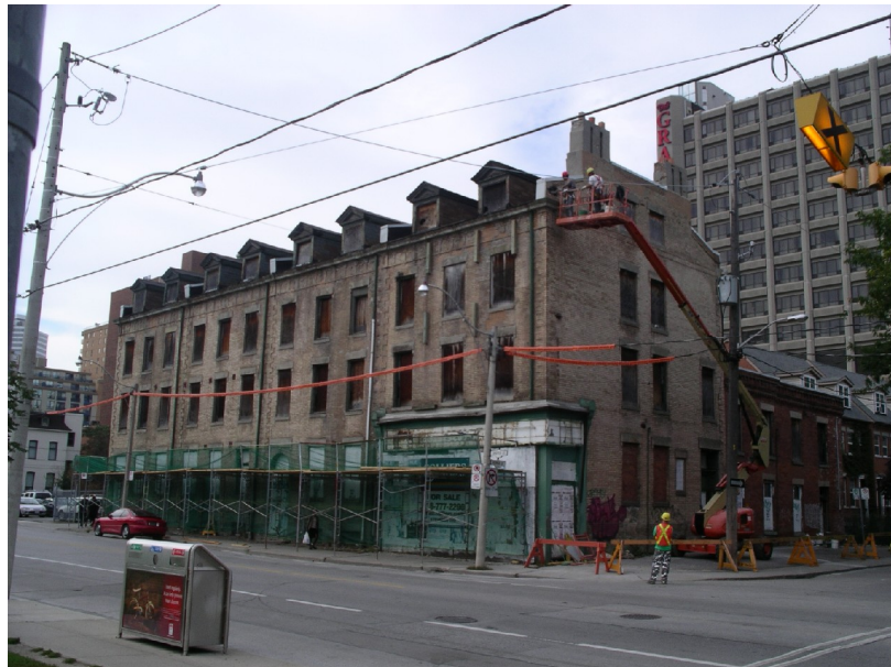
Photograph of Walnut Hall prior to its partial collapse and demolition (Heritage Preservation Services, 2006)