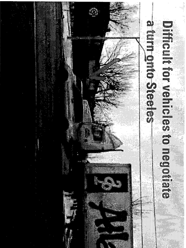
Difficult for vehicles to negotiate a turn onto Steeles