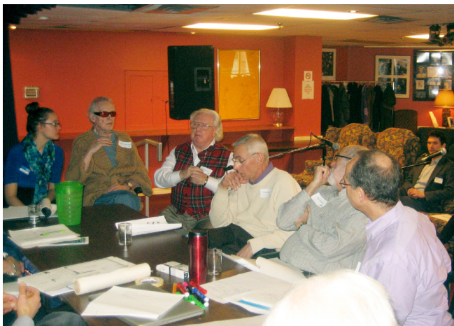
Charrette workshop discussion.

“I am a low-income senior recovering from day surgery. I am not able to leave the hospital because I don’t have the support needed to go home. I want space in my building where I can recover.”