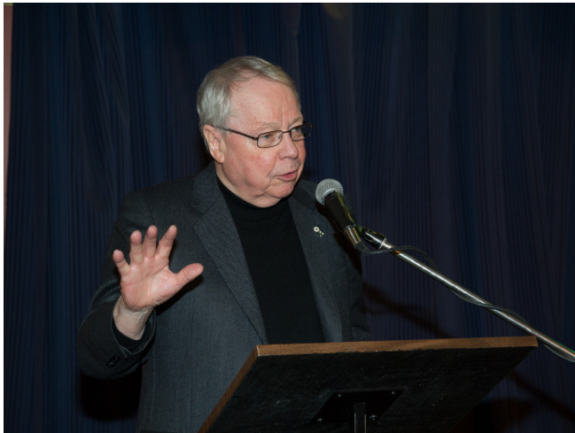
Former Toronto mayor David Crombie delivers opening remarks

In the opening remarks, David Crombie spoke about the urgency of these issues. He said governments are falling behind in the provision of housing, health and support services for an aging population of Torontonians. He congratulated PAL on shining a light on the lack of support and other services.