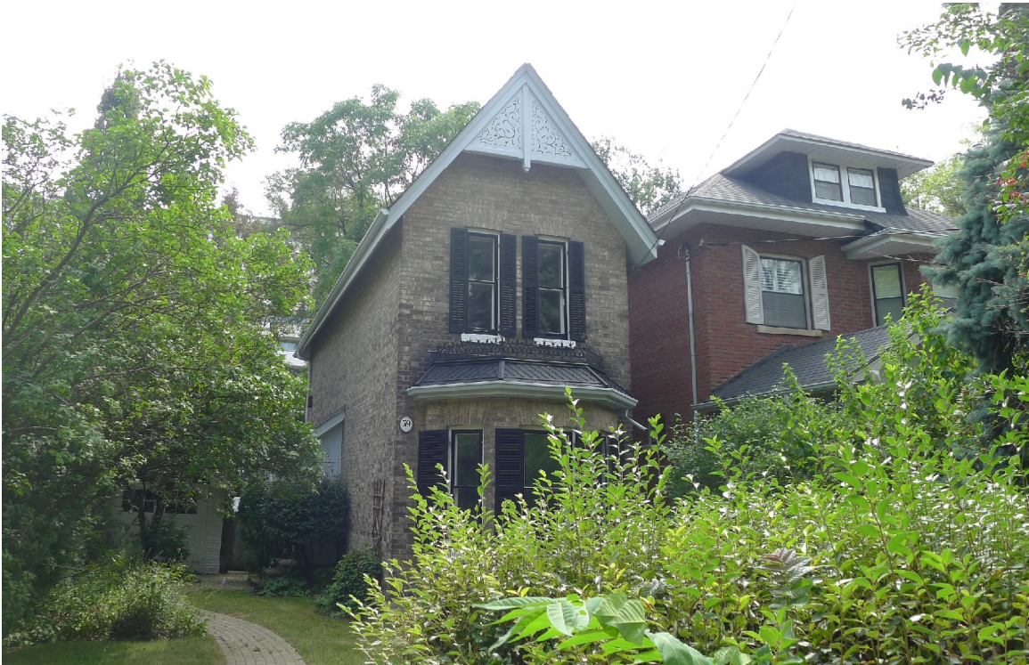
Principal façade of 59 Heath Street West (Heritage Preservation Services, August 2013)