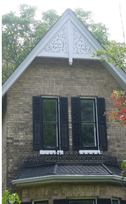
Detail View of 59 Heath Street West (HPS, August 2013)