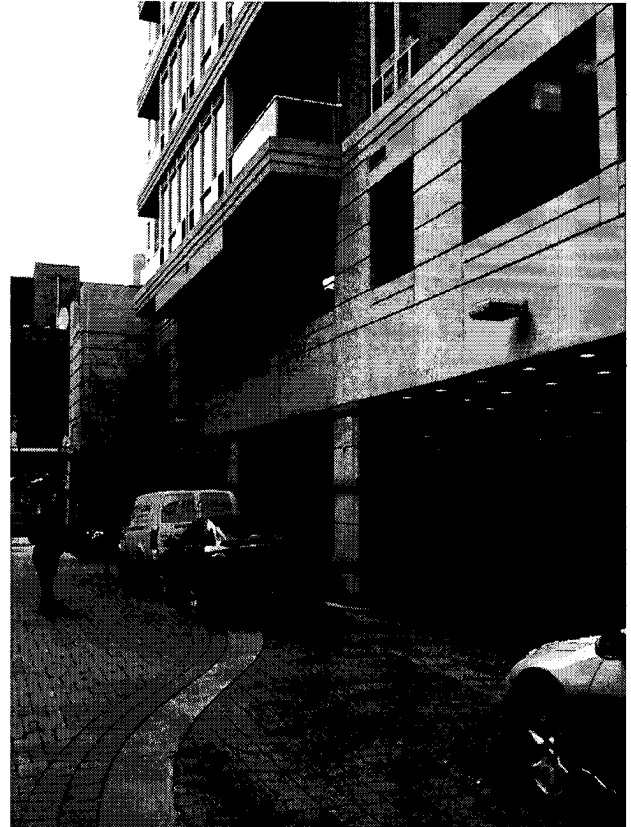
Minto-Yorkville residential access March 20, 2013: view looking south and north respectively

Thank you for taking our comments into consideration on this matter.