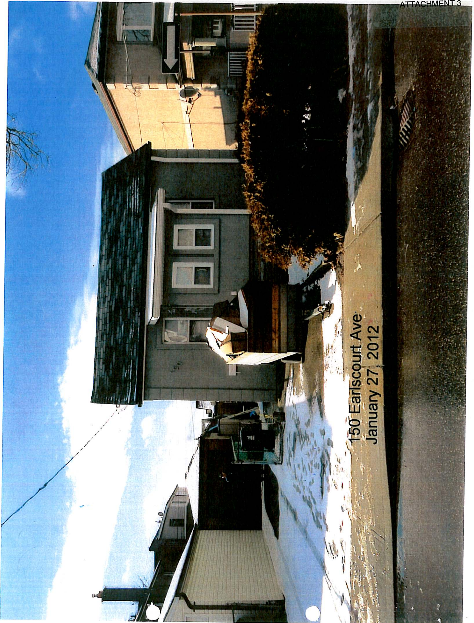
150 Earls court Ave January 27, 2012