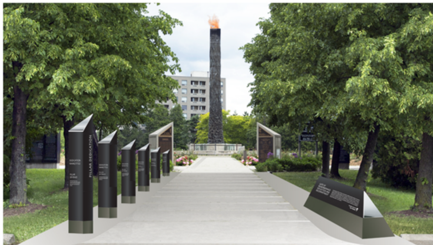
AFTER Gate of Remembrance, Reflection, and Recommitment