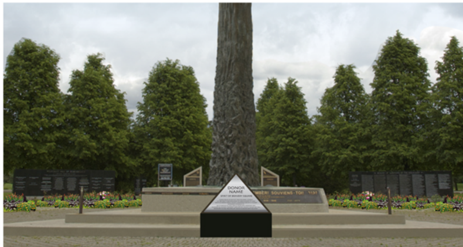
AFTER Spirit of Bravery Square