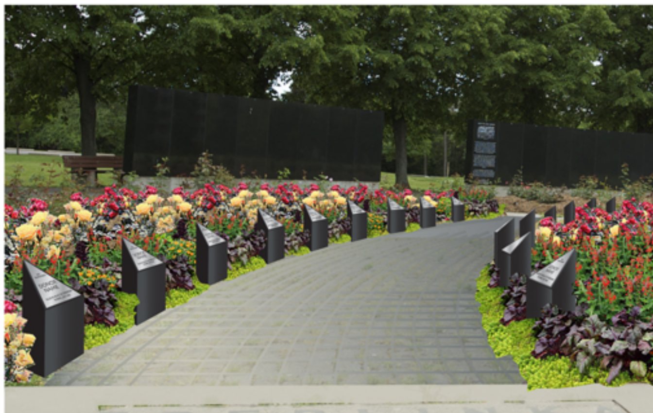
AFTER Pillars of Recollection