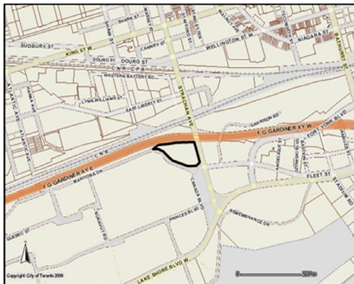
Figure 1: Key Map - 2 Strachan Avenue

The proposal is to replace the two sign faces (one with static copy, and one with animated readograph display), currently contained on the west face, with three sign faces (two displaying mechanical copy and one displaying electronic static copy). Although the number of sign faces on the west side will increase from two to three, the overall size of the sign (total sign face area) and height of the sign will remain unchanged.