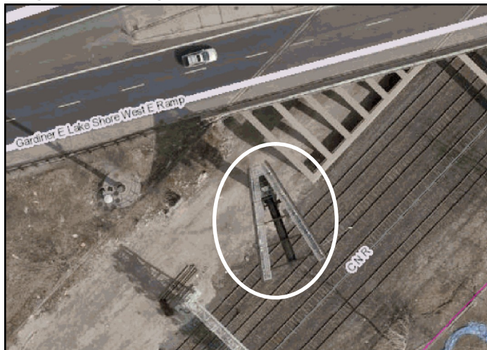
Figure 2 – The Sign at 0 Oakville Sub (aerial view)

The angle of the sign is consistent with the submission that formed part of the sign variance application that was approved by Etobicoke York Community Council in February 2010. The angle of the sign is also consistent with the plans approved as part of sign permit #10-124529, in March 2010.