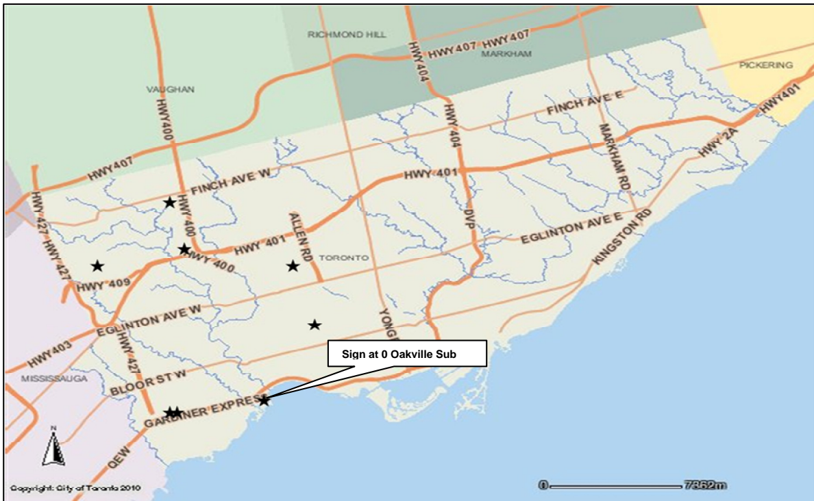
Figure 5 – The Approximate Locations of Other Third Party Signs Displaying Electronic Static Copy Where Illumination Levels are Proposed to be Reduced