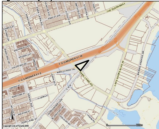
Figure 1 – Key Map: 0 Oakville Sub

Currently the sign displays electronic images and operates 24 hours a day with no restrictions on brightness and light cast onto adjacent properties. This report recommends approval of a revised proposal by Astral Media (the "Applicant") for a site-specific amendment that would allow the existing sign to remain at its current height and continue to operate 24 hours a day with a reduction in the brightness of the sign and light cast onto adjacent properties.