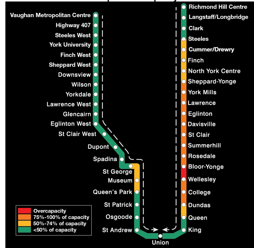
2031 AM Peak Hour Southbound Subway Volumes Compared to Capacity