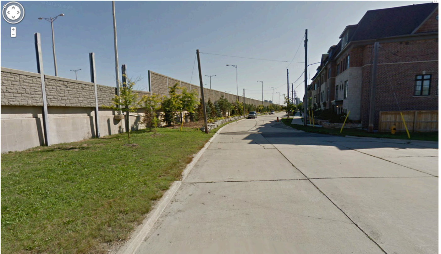
Figure 3: View of access road to 855 Oxford Street