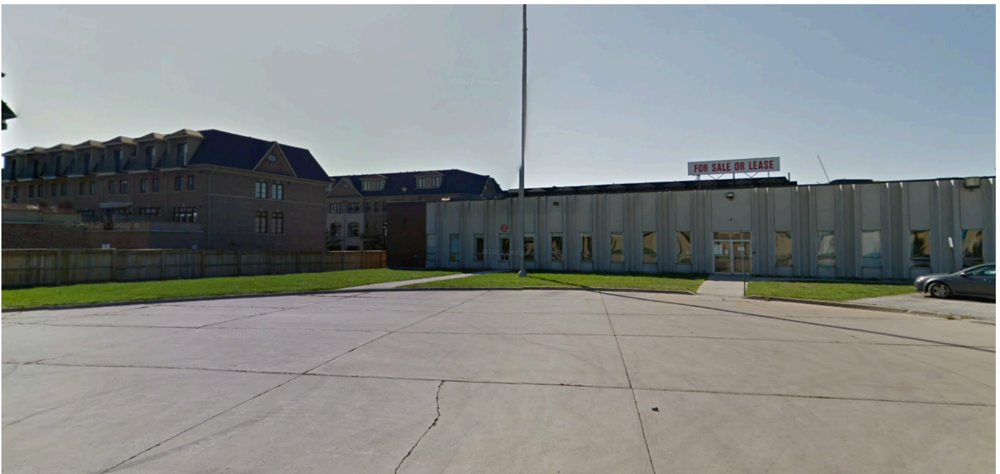
Figure 4: View of 855 Oxford Street