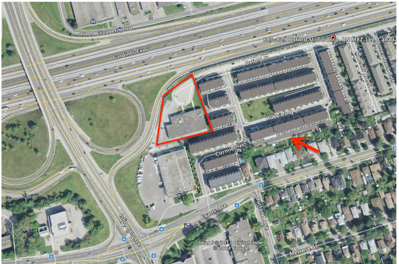
Figure 2: 855 Oxford Street today - adjacent use is now residential townhouse development