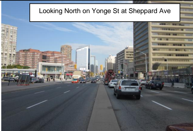
Looking North on Yonge St at Sheppard Ave