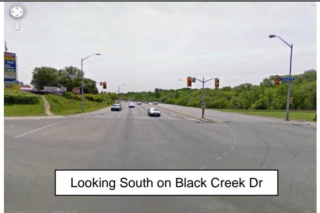
Looking South on Black Creek Dr