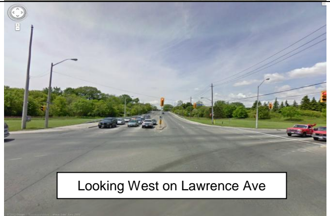
Looking West on Lawrence Ave