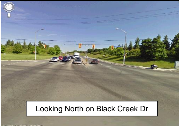
Looking North on Black Creek Dr

The intersection of Black Creek Drive and Lawrence Avenue West is located in the Etobicoke-York District. It is the first at grade signalized intersection on Black Creek Drive from Highway 400 southbound. The existing speed limit on Black Creek Dr approaching the intersection is 70 km/h. Lawrence Avenue, east and west of Black Creek Dr, operates under restricted traffic flow. The posted speed limit approaching the intersection is 60 km/h.