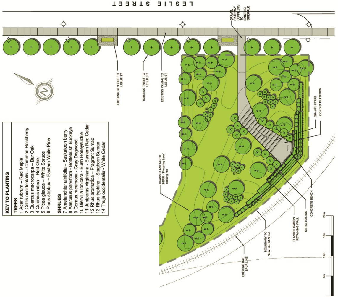
Leslie Street Look-out: Plans

BROWN + STOREY ARCHITECTS INC. CONSULTEC LTD.