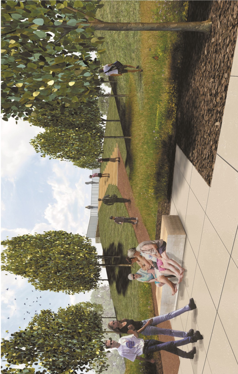
Leslie Street Look-out: View

BROWN + STOREY ARCHITECTS INC. CONSULTEC LTD.