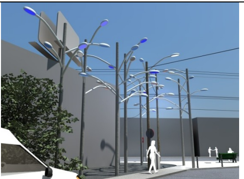
Nyctophilia, Ward 11