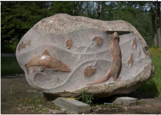
Joel Weeks Park, Ward 30