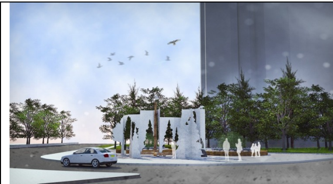
Mimico Creek, Ward 5