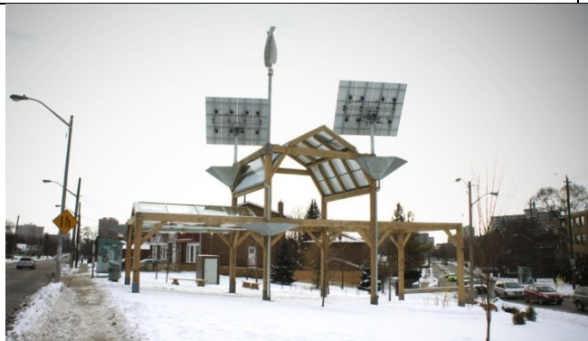
Dawes Crossing, Ward 31